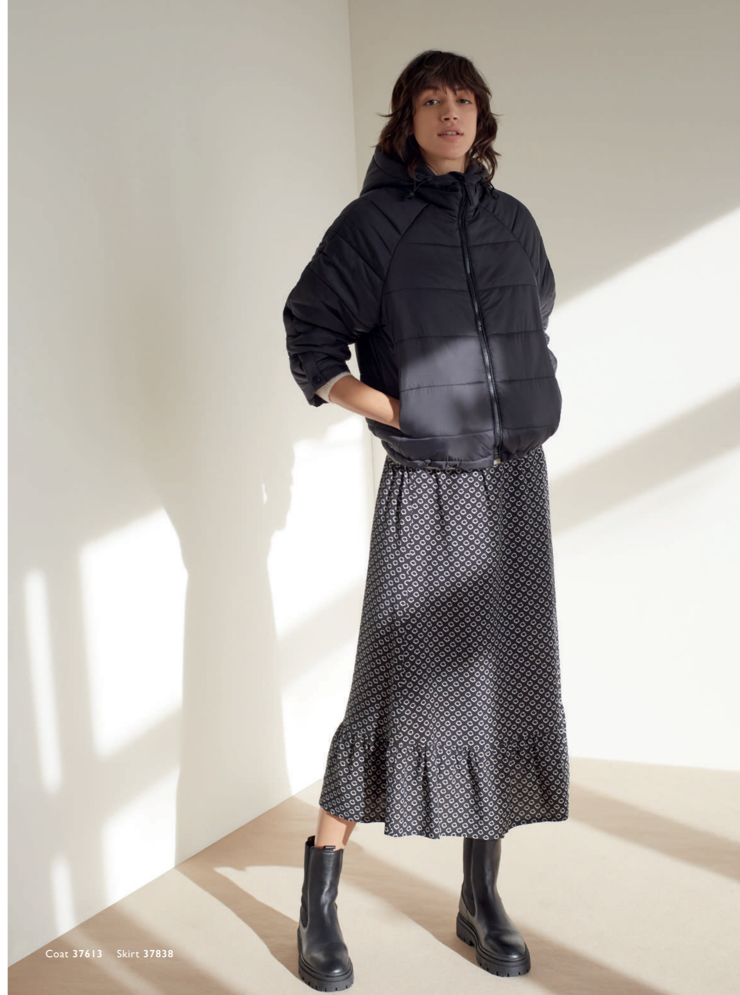
Coat 37613 Skirt 37838