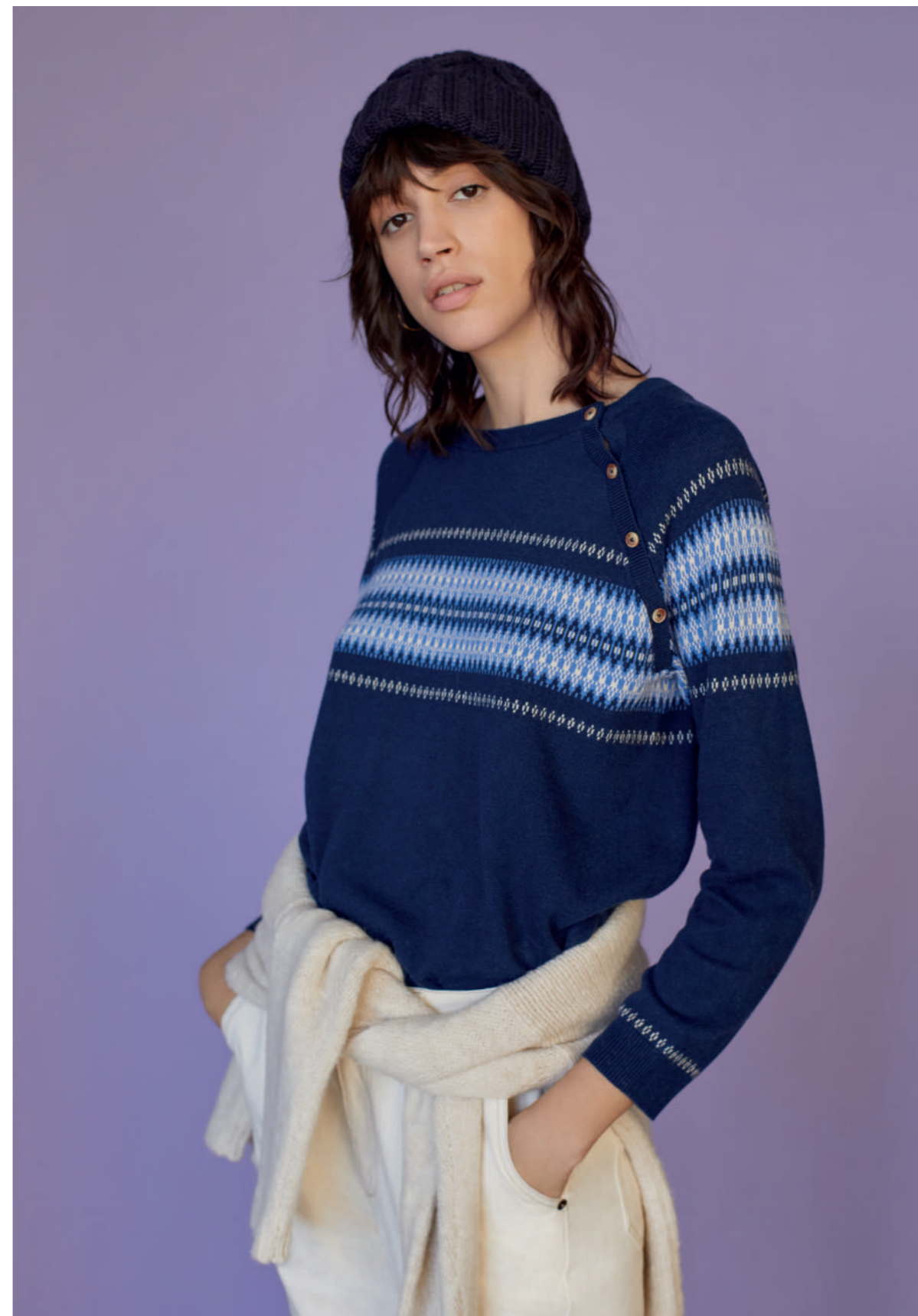
Sweater 37511 Cardigan 37554 Pants 37823 Hat 37930