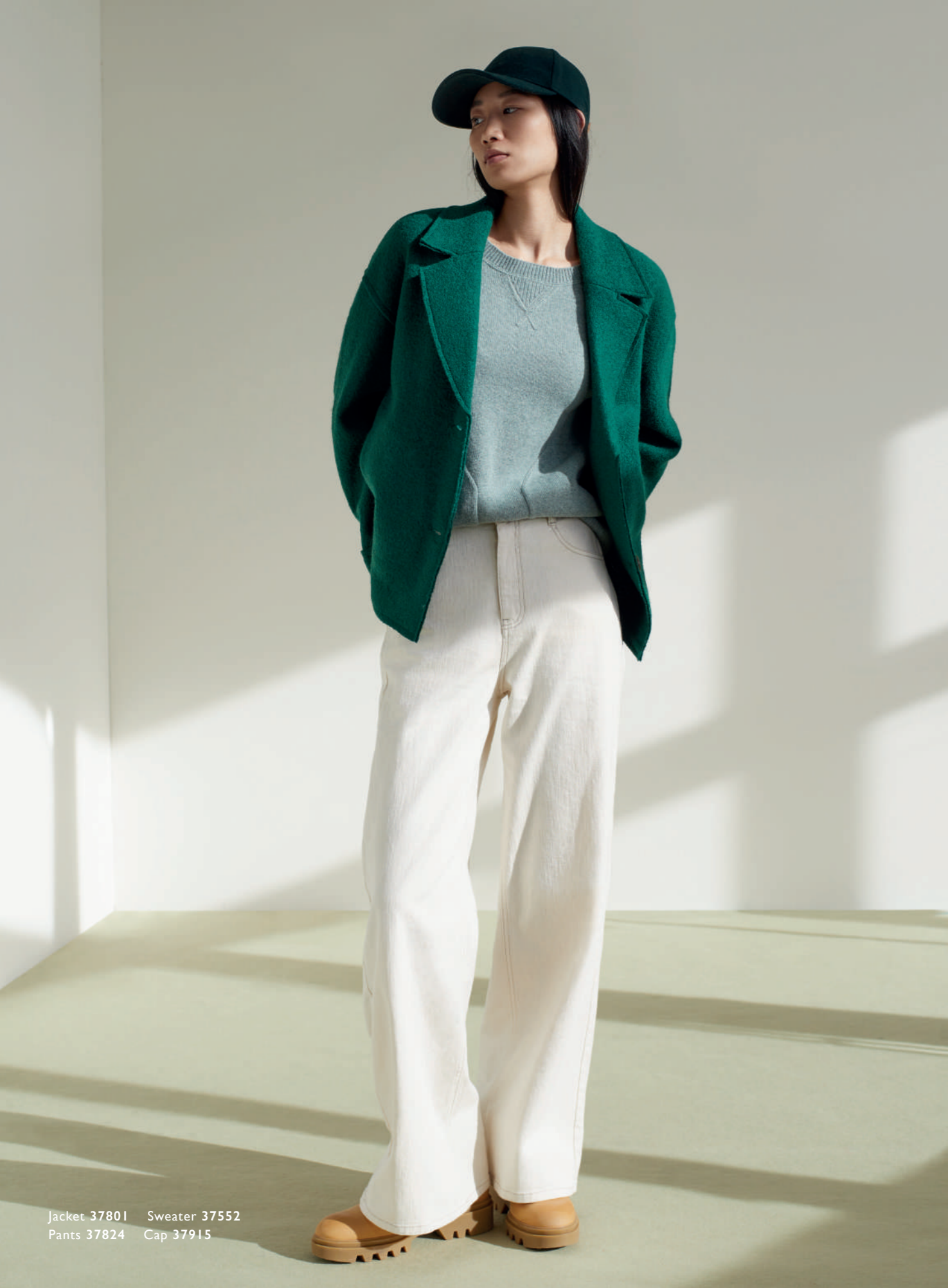
Jacket 37801 Sweater 37552 Pants 37824 Cap 37915