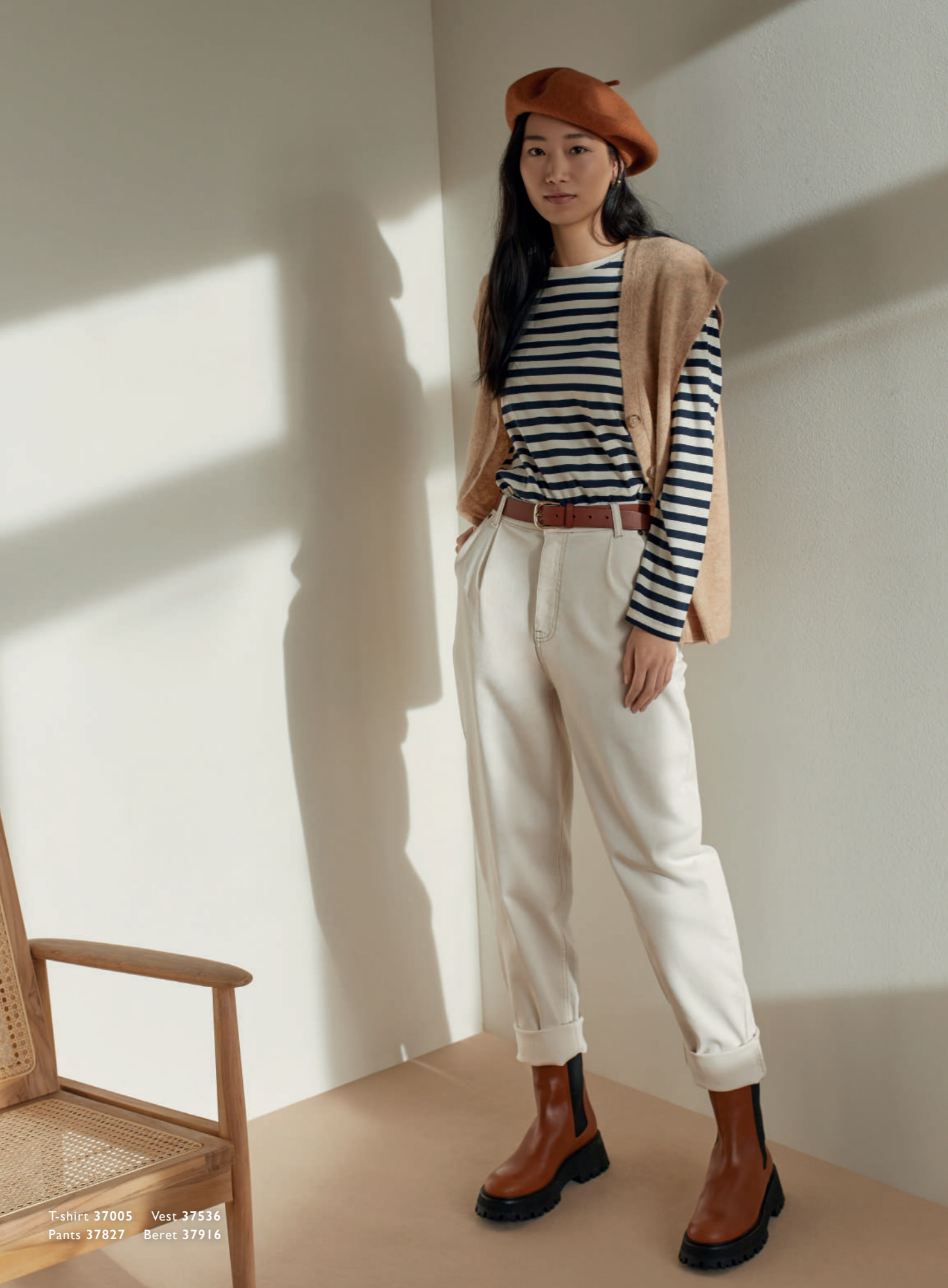
T-shirt 37005 Vest 37536 Pants 37827 Beret 37916