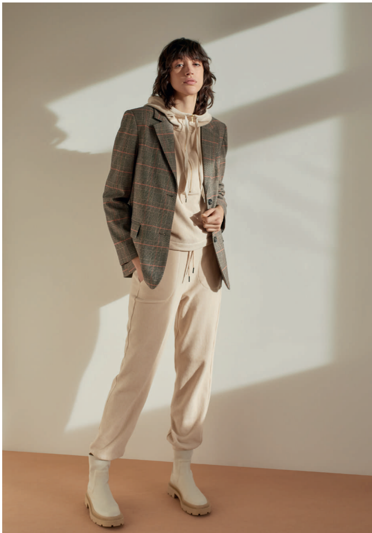
Jacket 37804 Sweatshirt 37464 Pants 37461