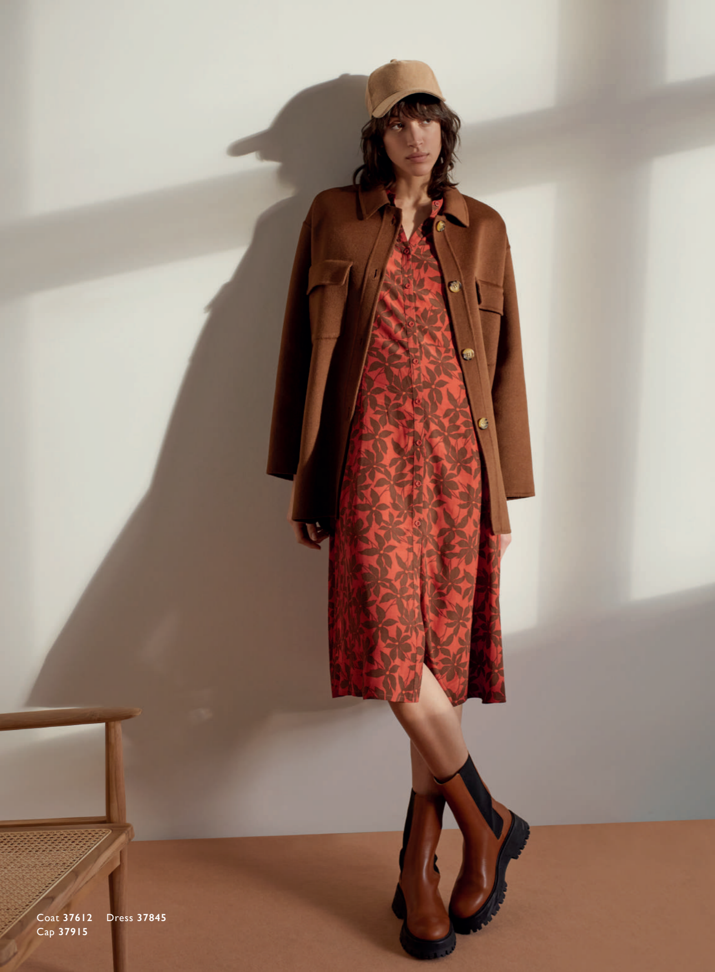
Coat 37612 Dress 37845 Cap 37915