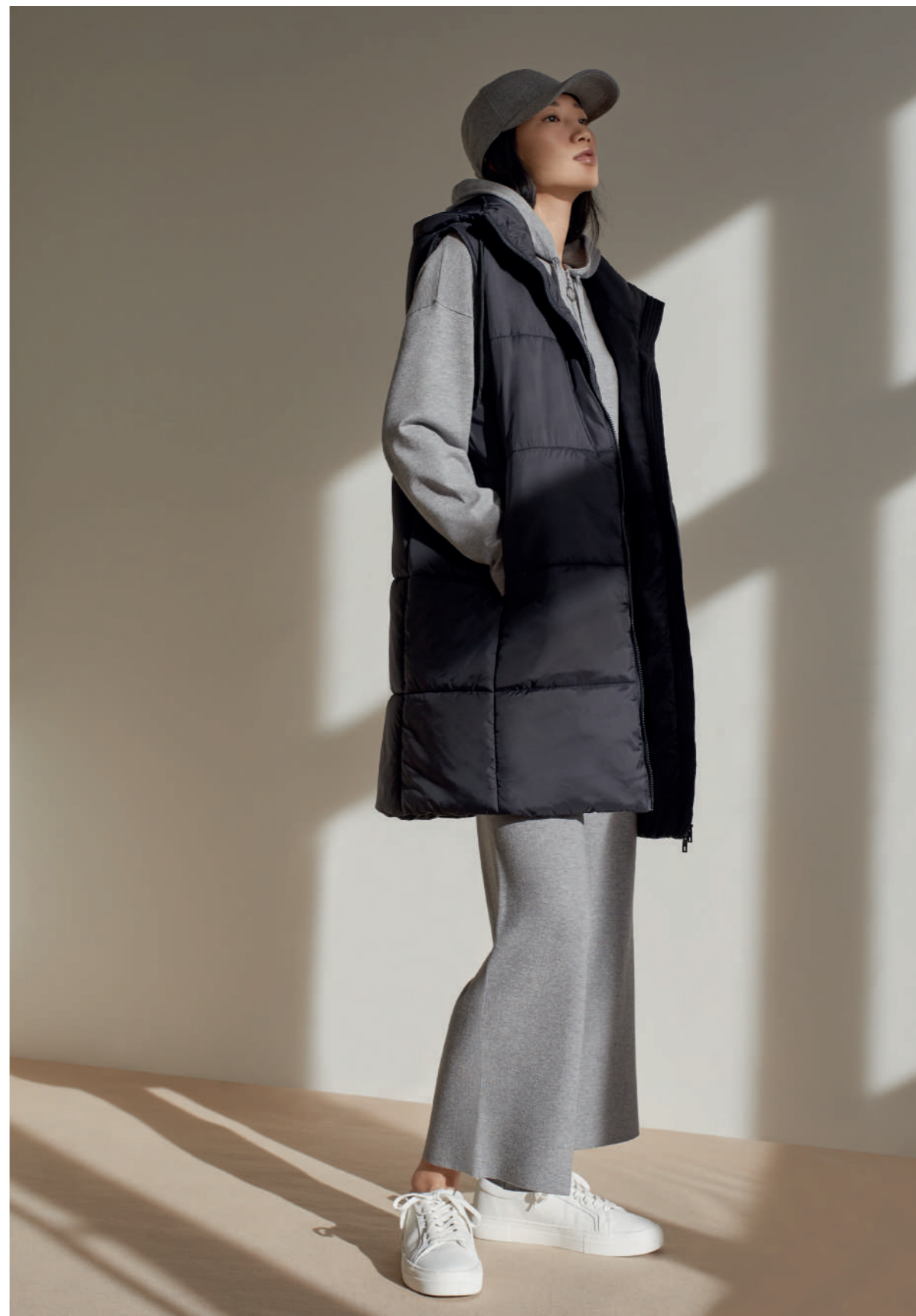
Vest 37803 Jacket 37525 Pants 37528 Cap 37915