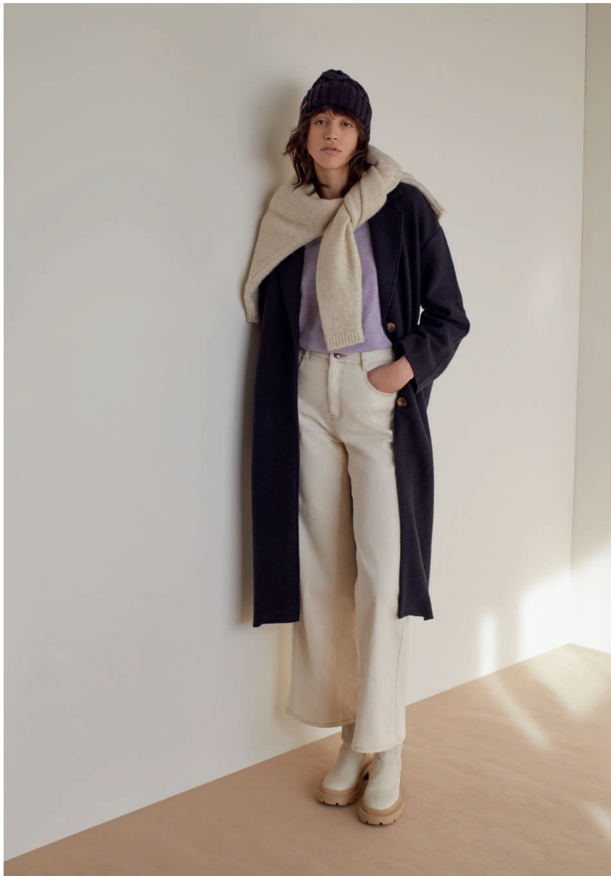
Coat 37609 Cardigan 37554 Sweater 37500 Pants 37824 Hat 37930