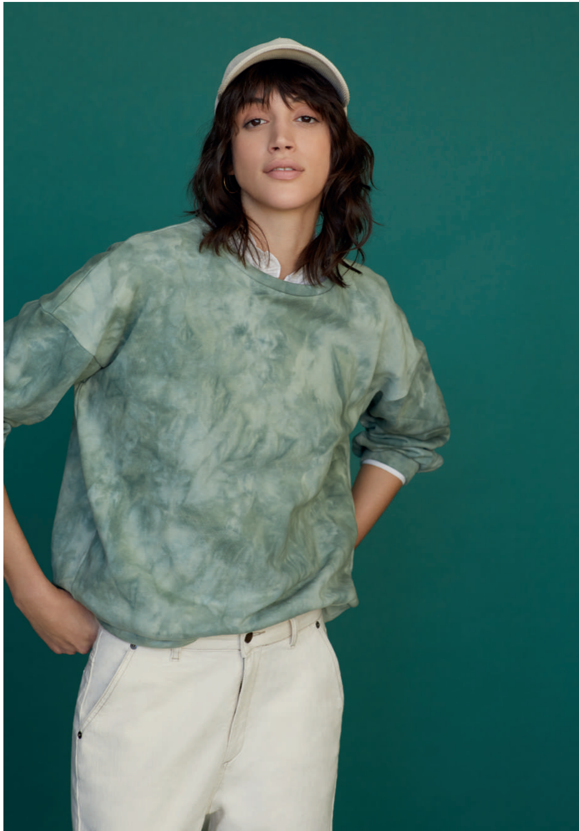
Sweatshirt 37330 T-shirt 37407 Pants 37823