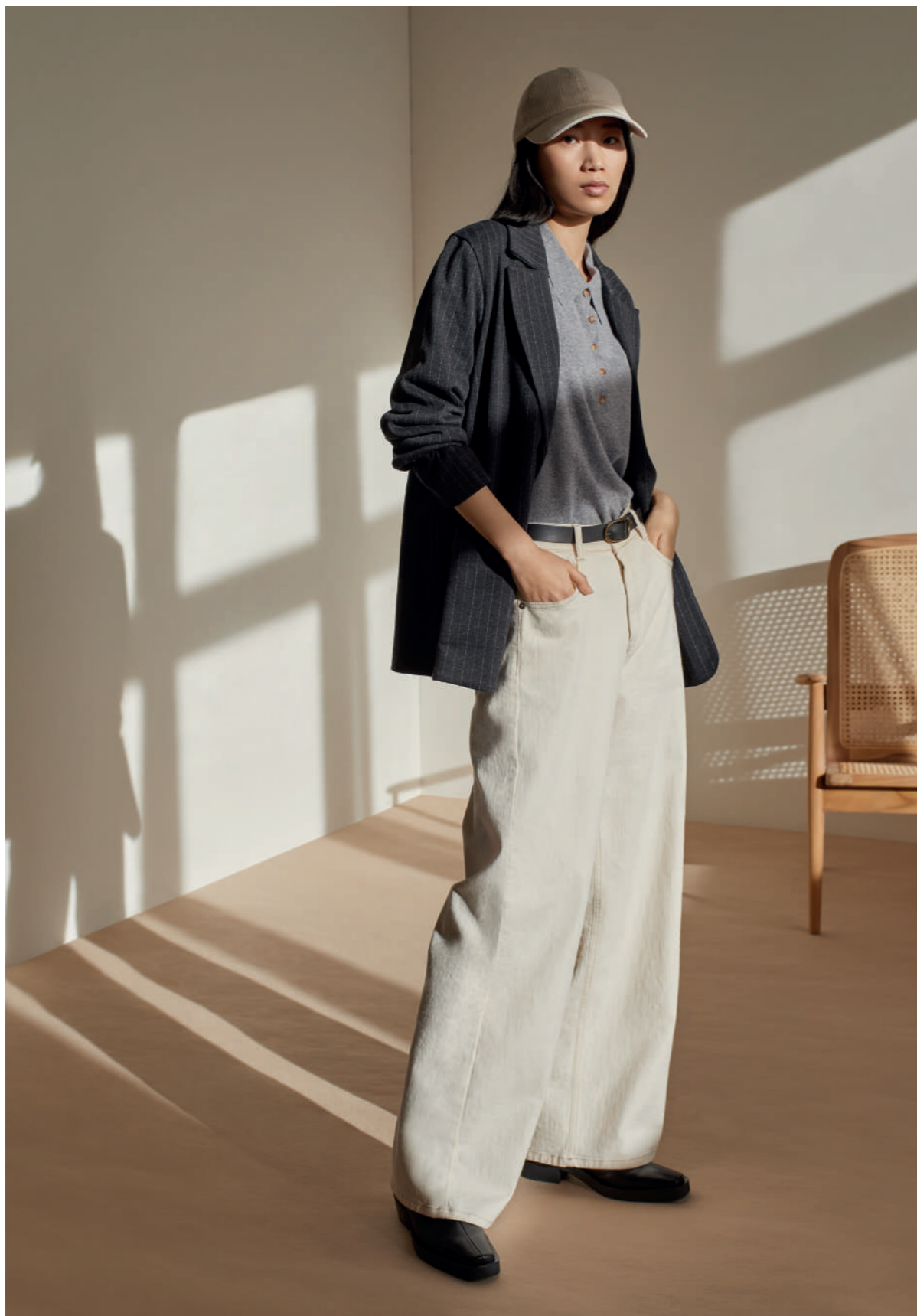
Jacket 37380 Sweater 37513 Pants 37824