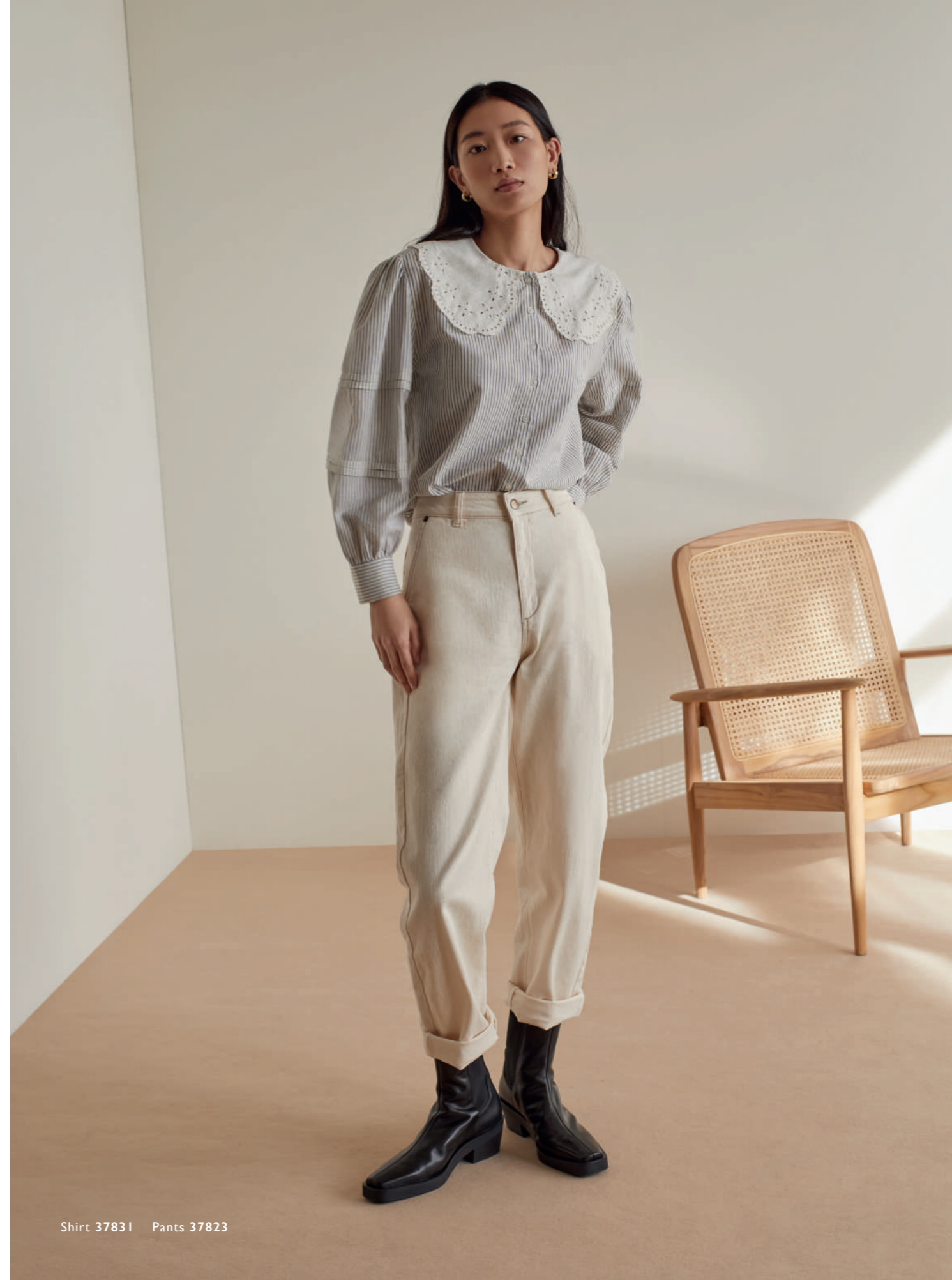
Shirt 37831 | Pants 37823