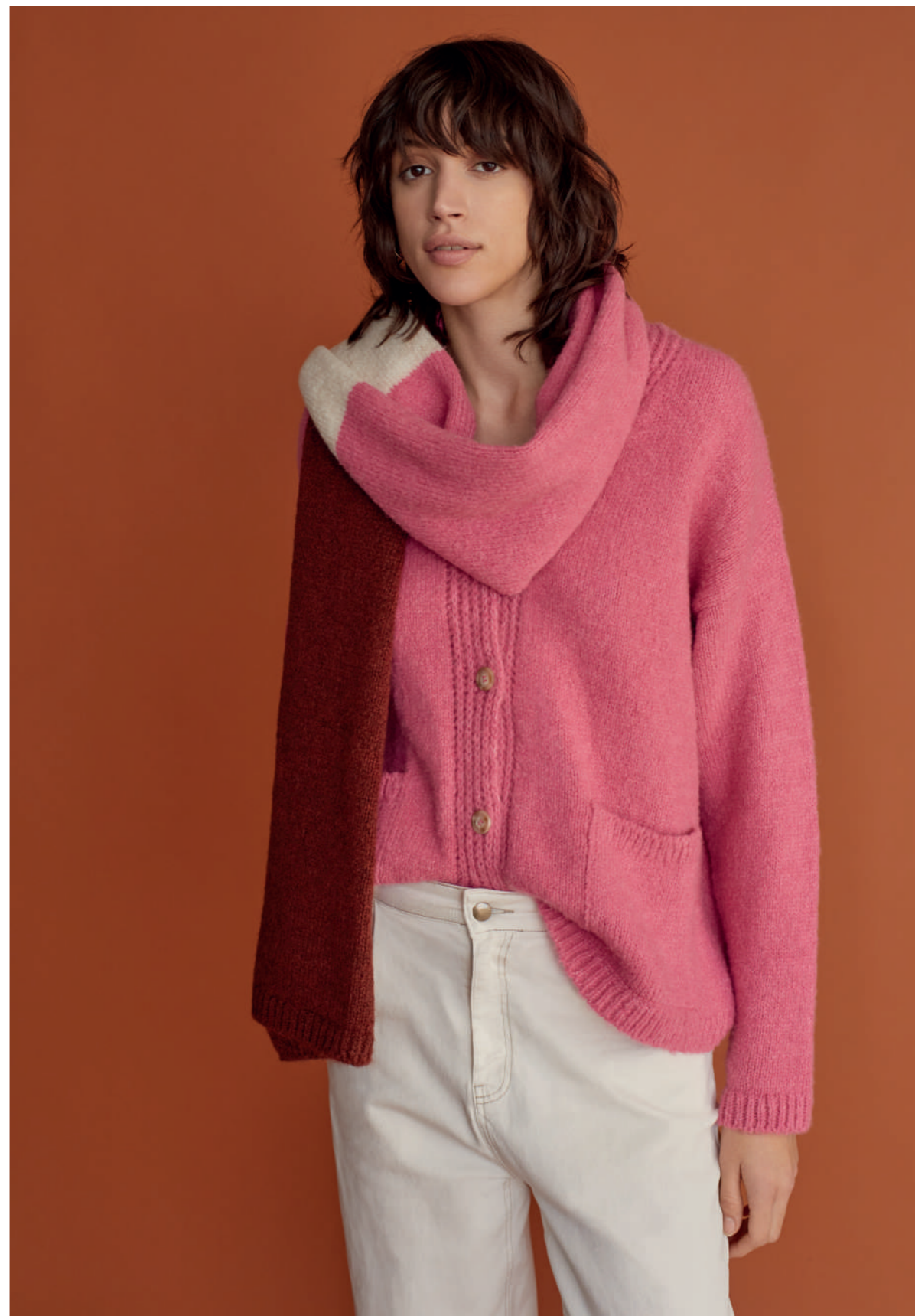
Cardigan 37554 Pants 37823 Scarf 37918