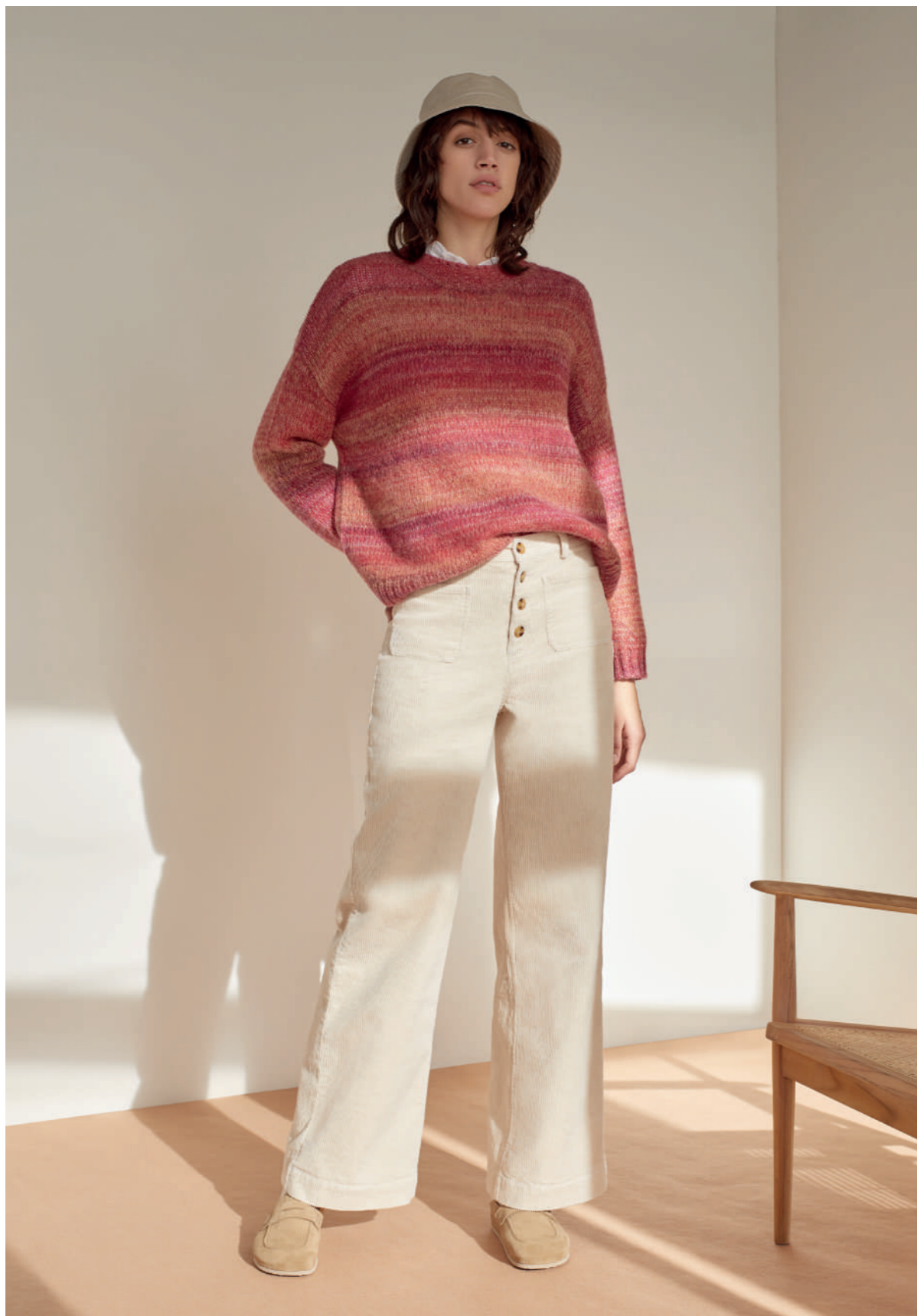
Sweater 37561 T-shirt 37407 Pants 37821