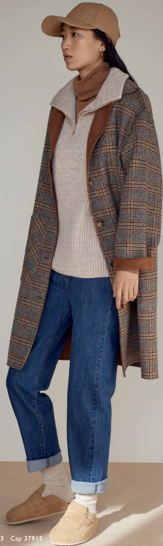
Coat 37601 Vest 37544 Sweater 37519 Pants 37823 Cap 37915