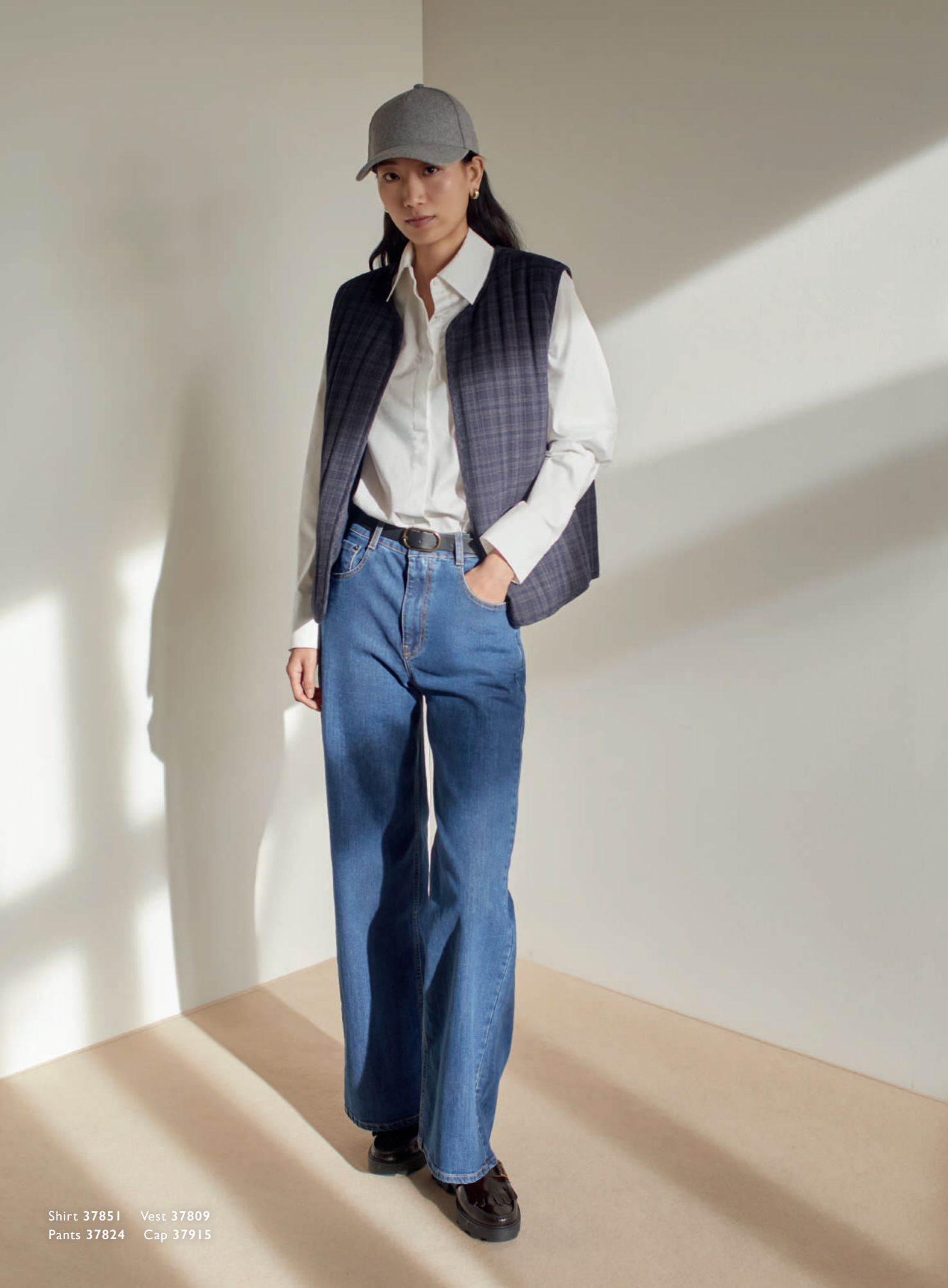
Shirt 37851 Vest 37809 Pants 37824 Cap 37915