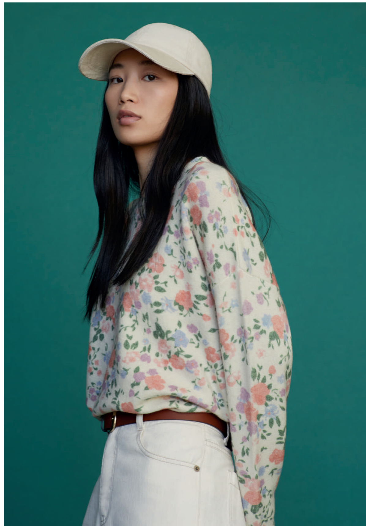
Sweater 37569 Pants 37824