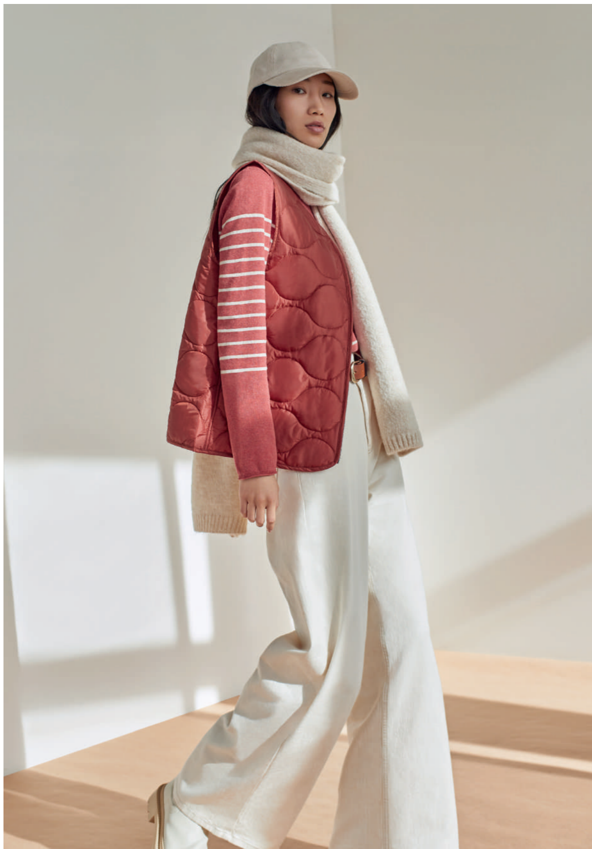
Vest 37800 Sweater 37504 Pants 37824 Scarf 37918