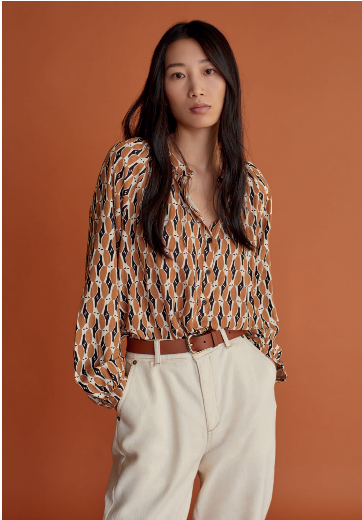
Shirt 37841 Pants 37823