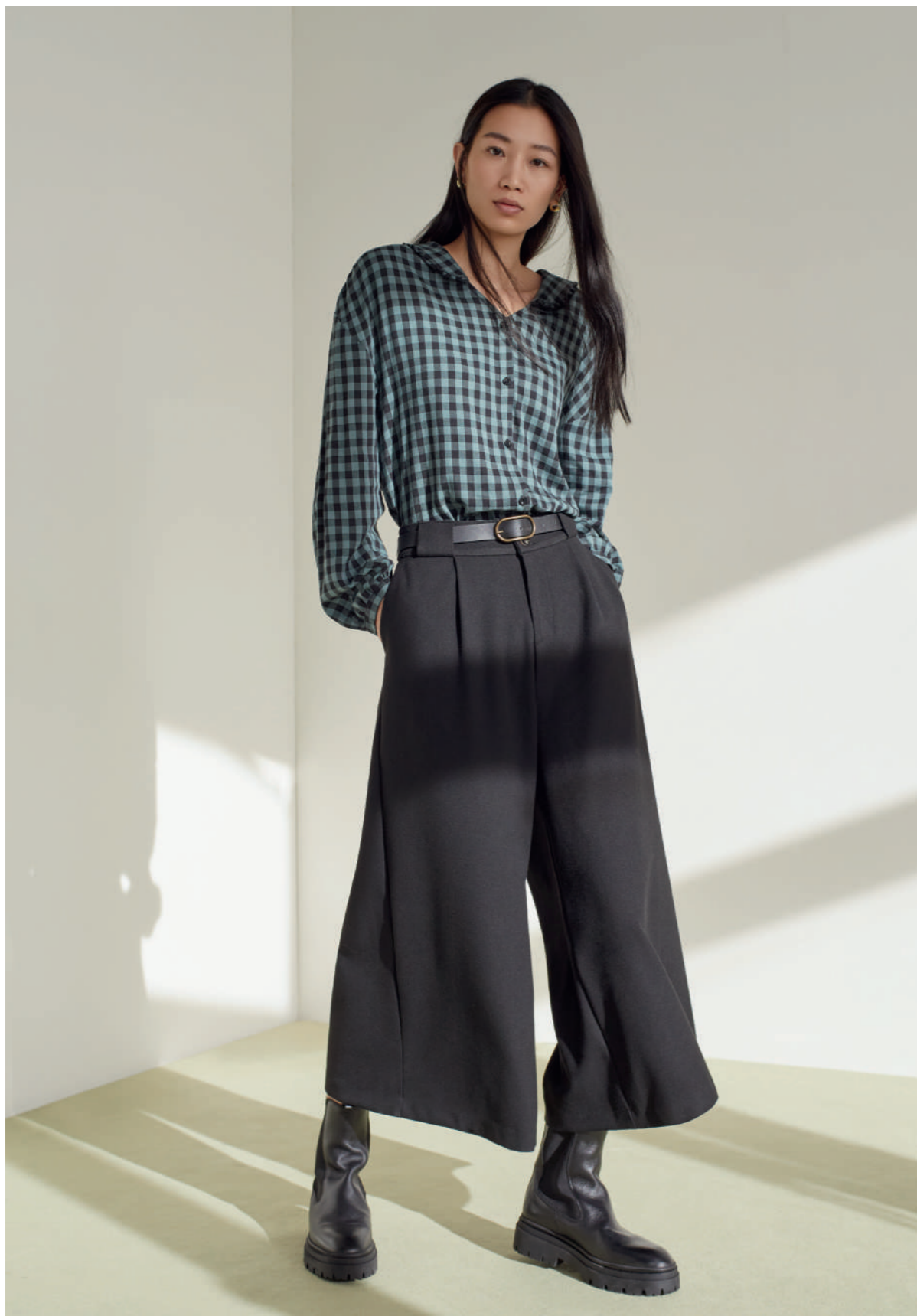
Shirt 37813 Pants 37807