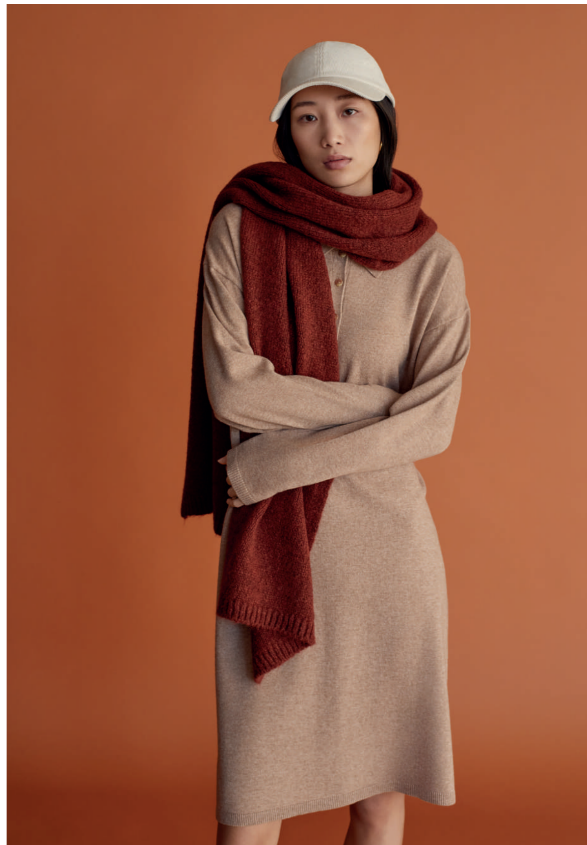
Dress 37516 Scarf 37918