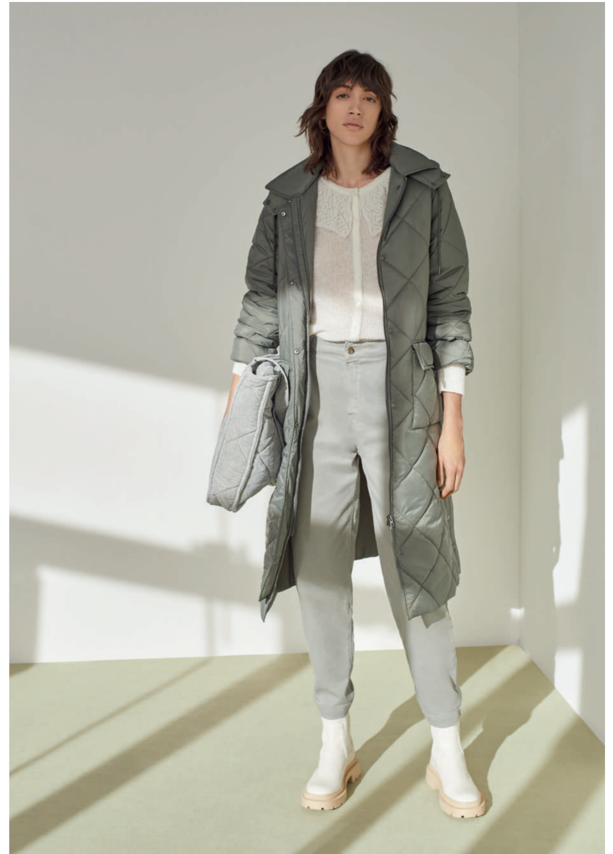
Coat 37606 Sweater 37564 Pants 37827 Bag 37928