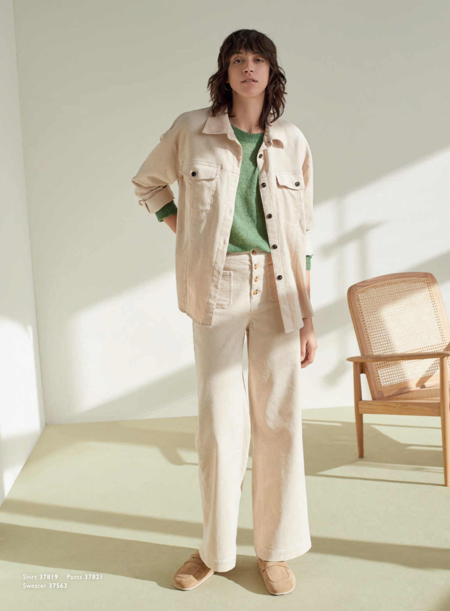
Shirt 37819 Pants 37821 Sweater 37563