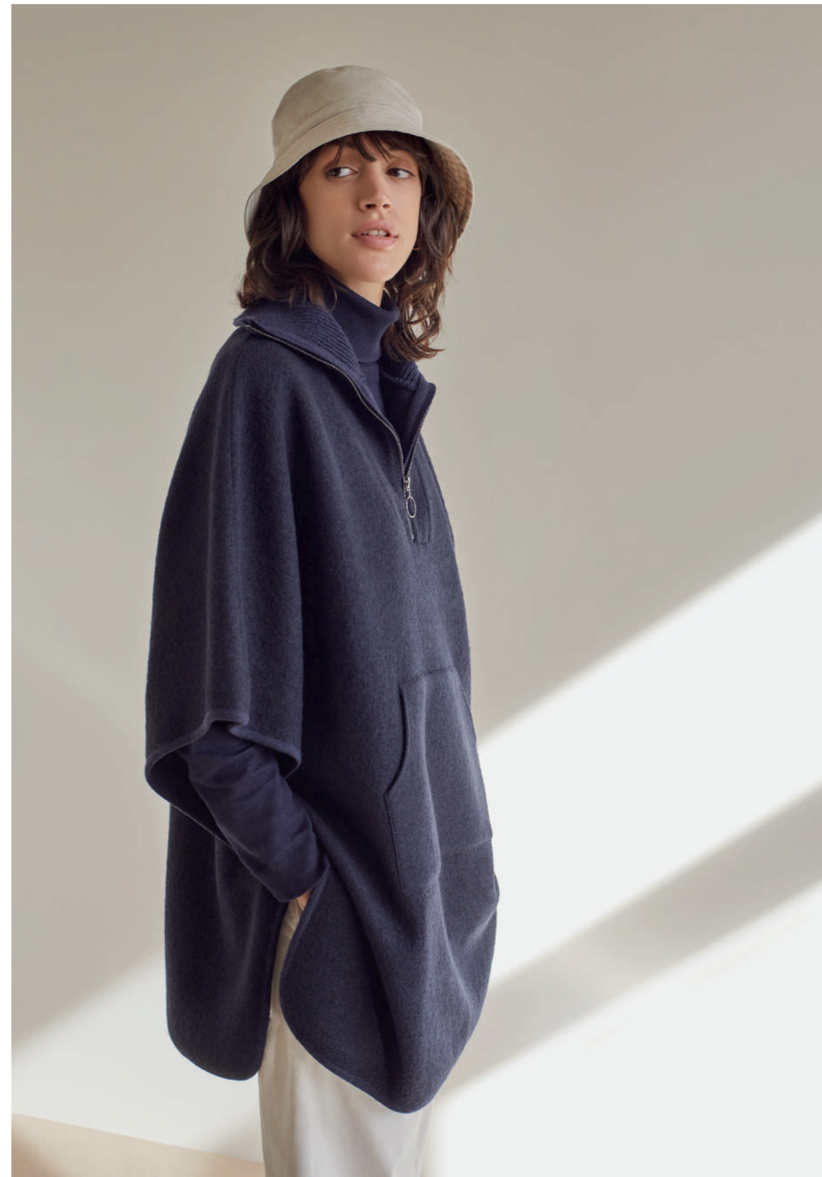
Poncho 37610 Sweater 37519 Pants 37823