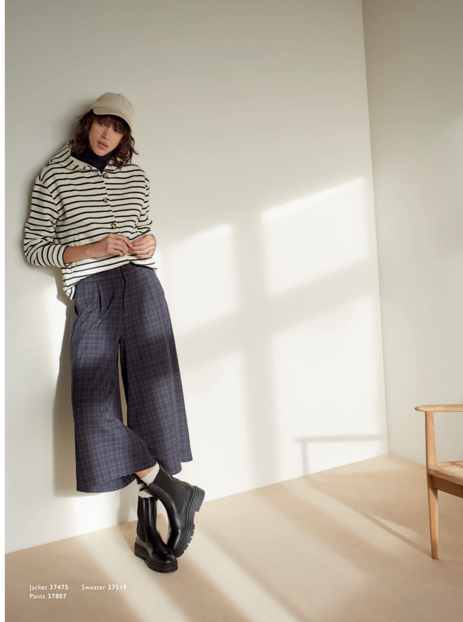
Jacket 37475 Sweater 37519 Pants 37807