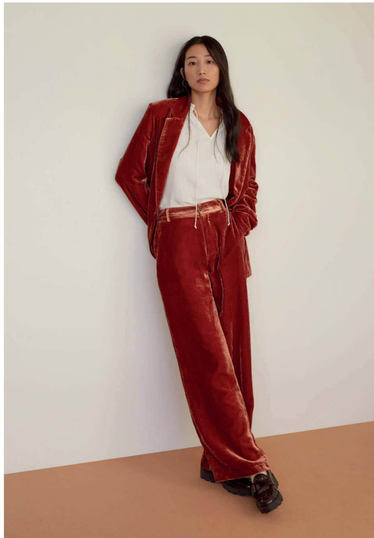
Jacket 37859 Shirt 37122 Pants 37860