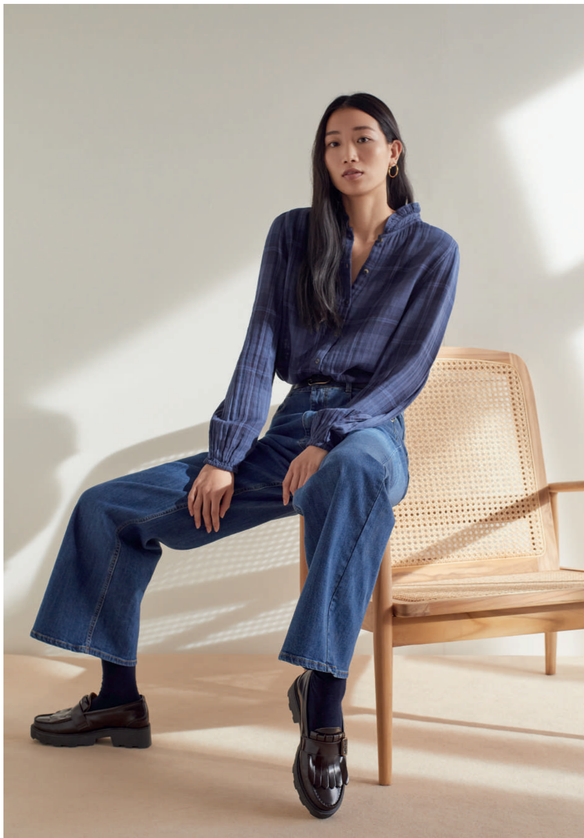
Shirt 37833 Pants 37824