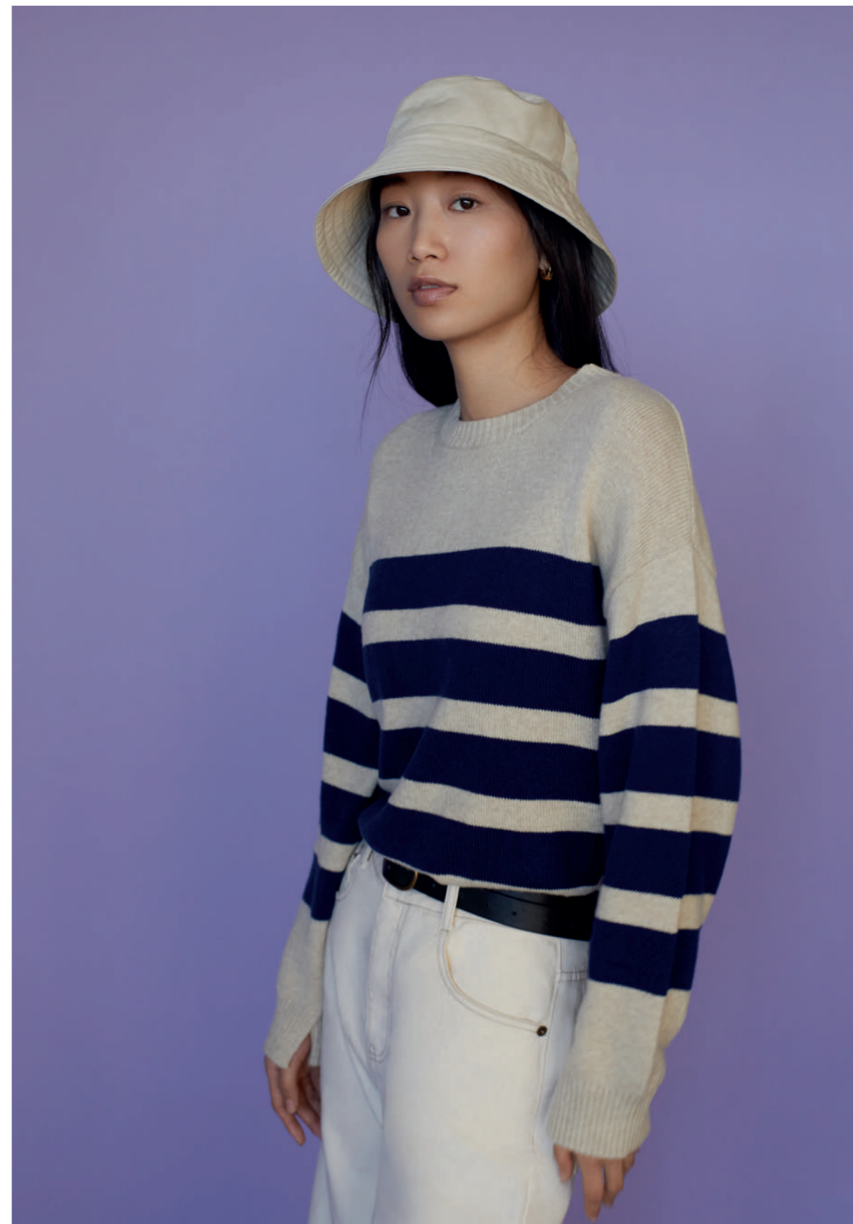
Sweater 37551 Pants 37824