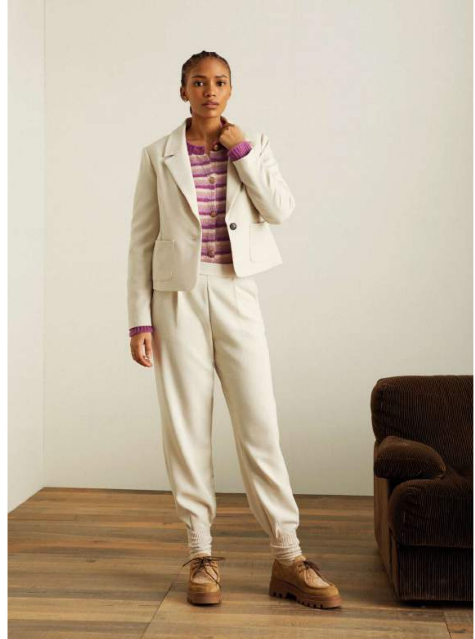
Jacket 39812 | Cardigan 39561 | Pants 39815