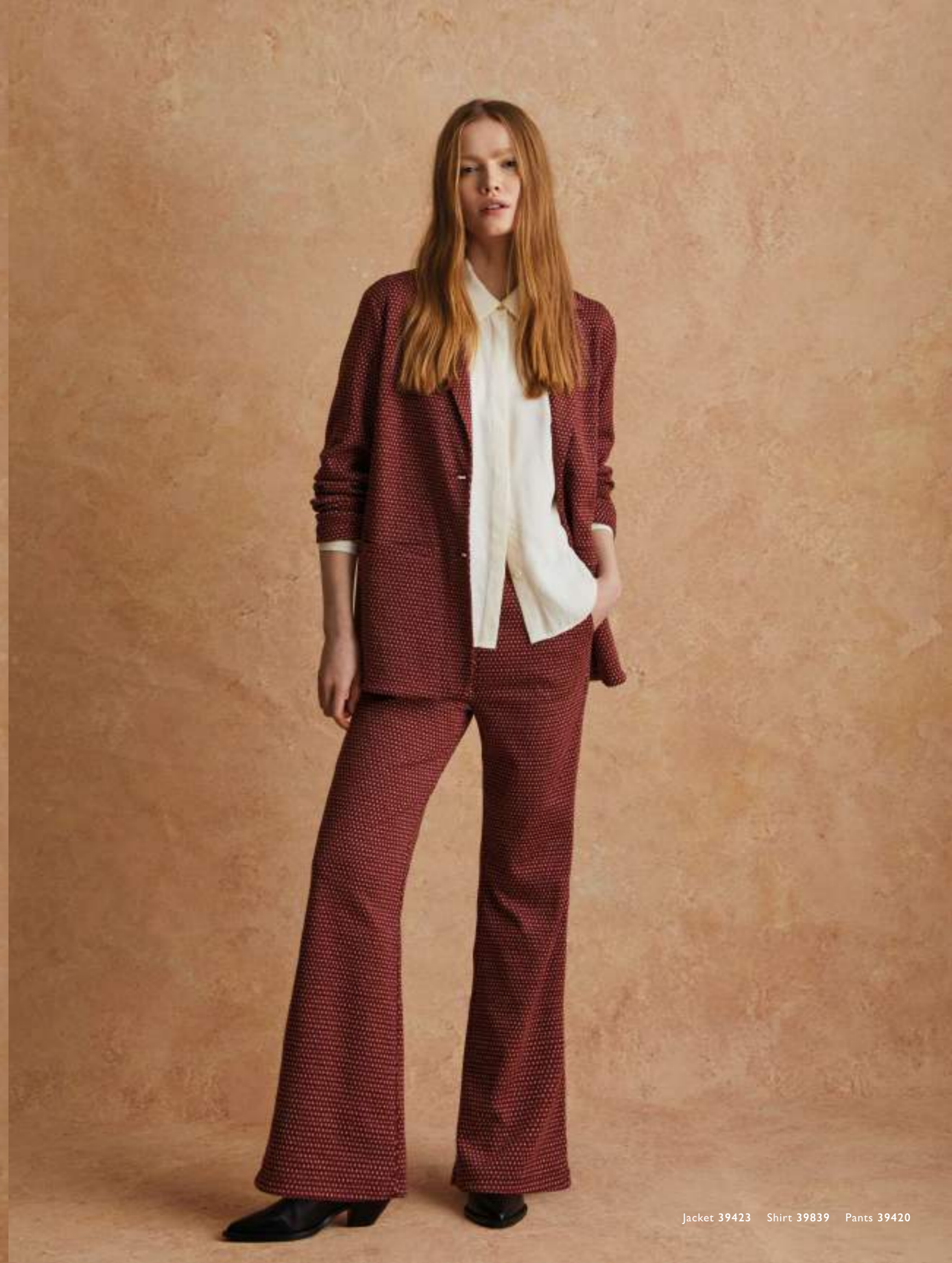
Jacket 39423 Shirt 39839 Pants 39420