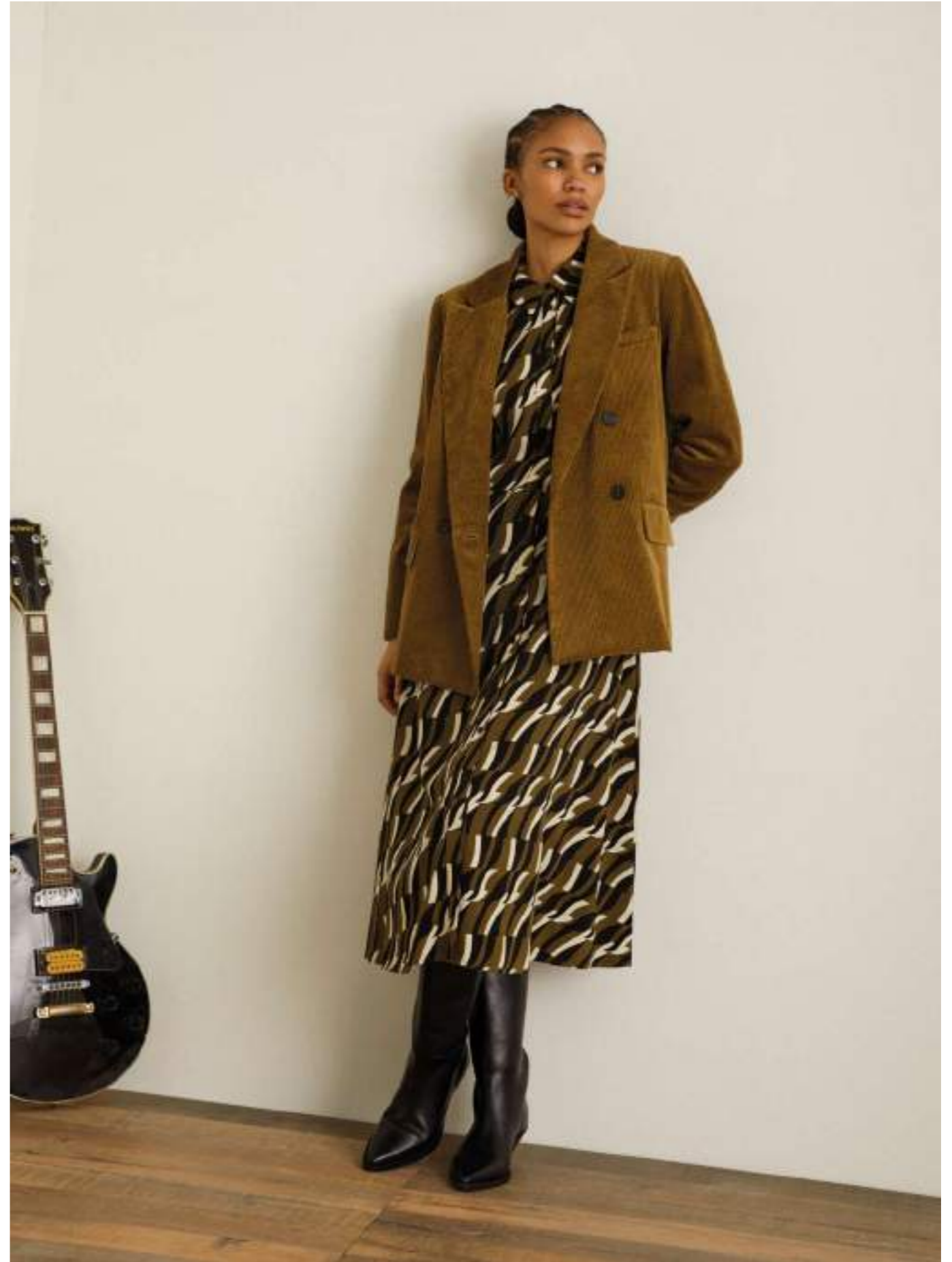
Jacket 39800 Dress 39845