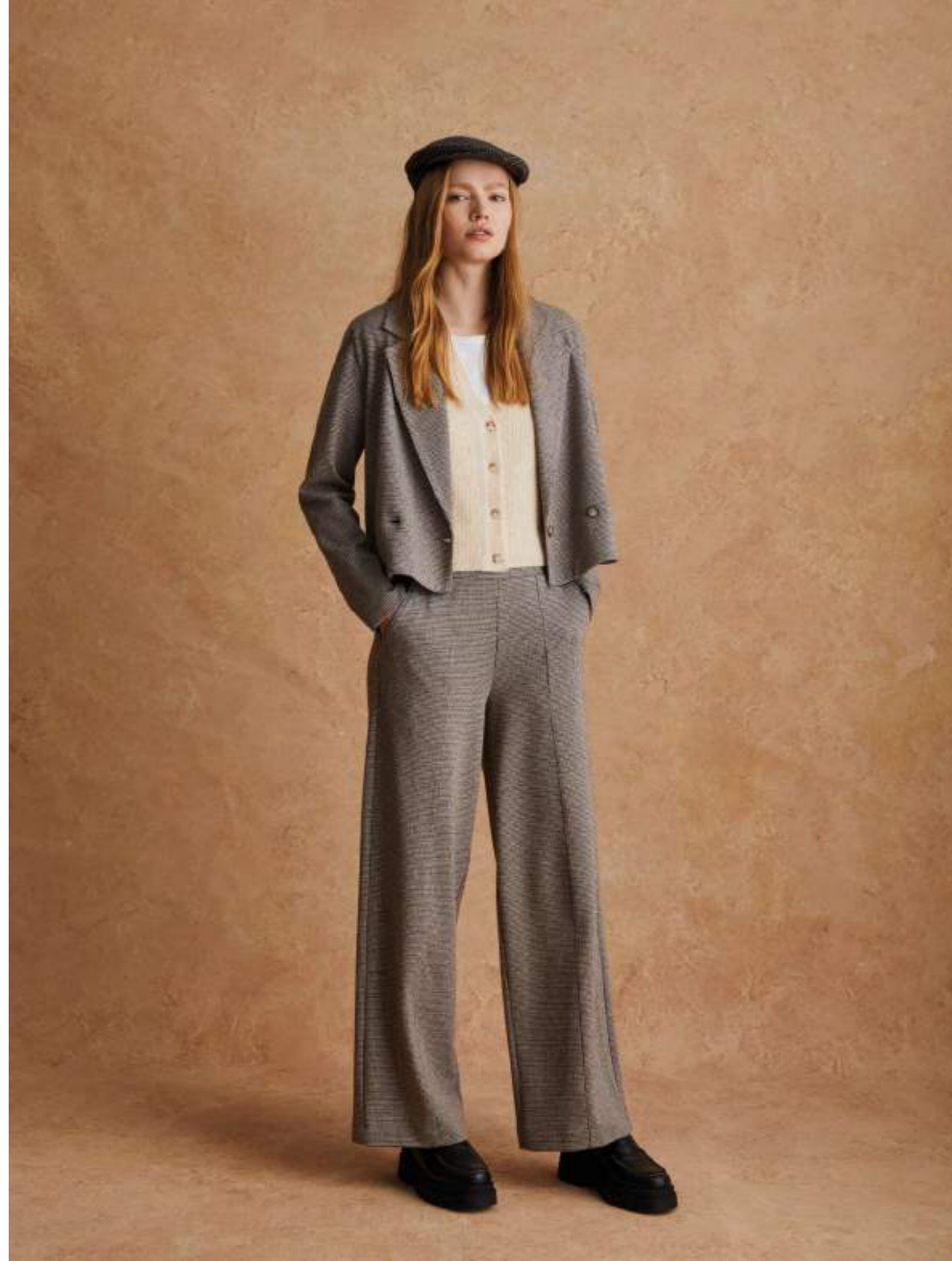
Jacket 39380 | Vest 39540 | T-shirt 39004 | Pants 39381