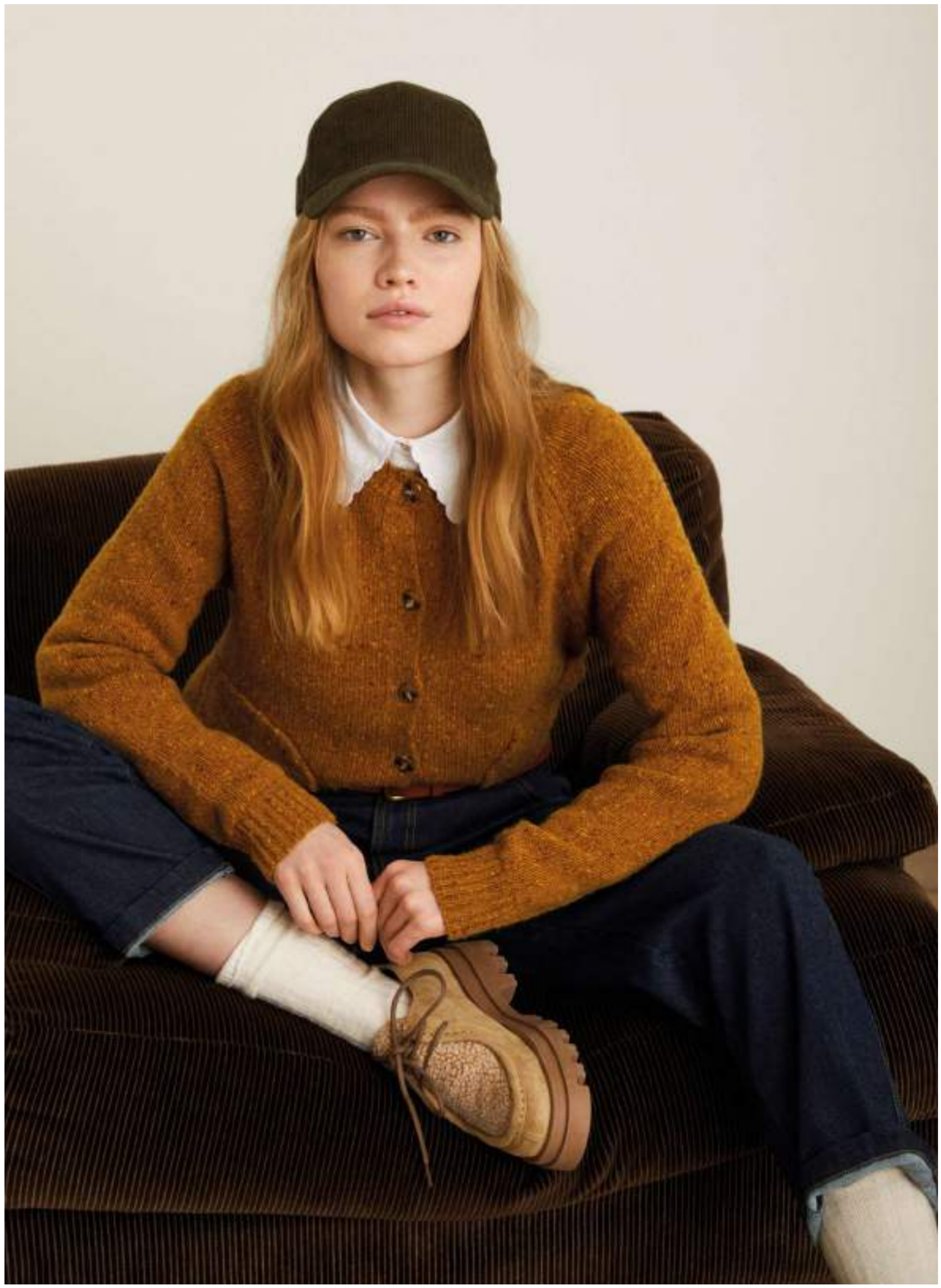
Jacket 39629 Shirt 39402 Cardigan 39532 Pants 39820 Cap 39926 Bag 39920