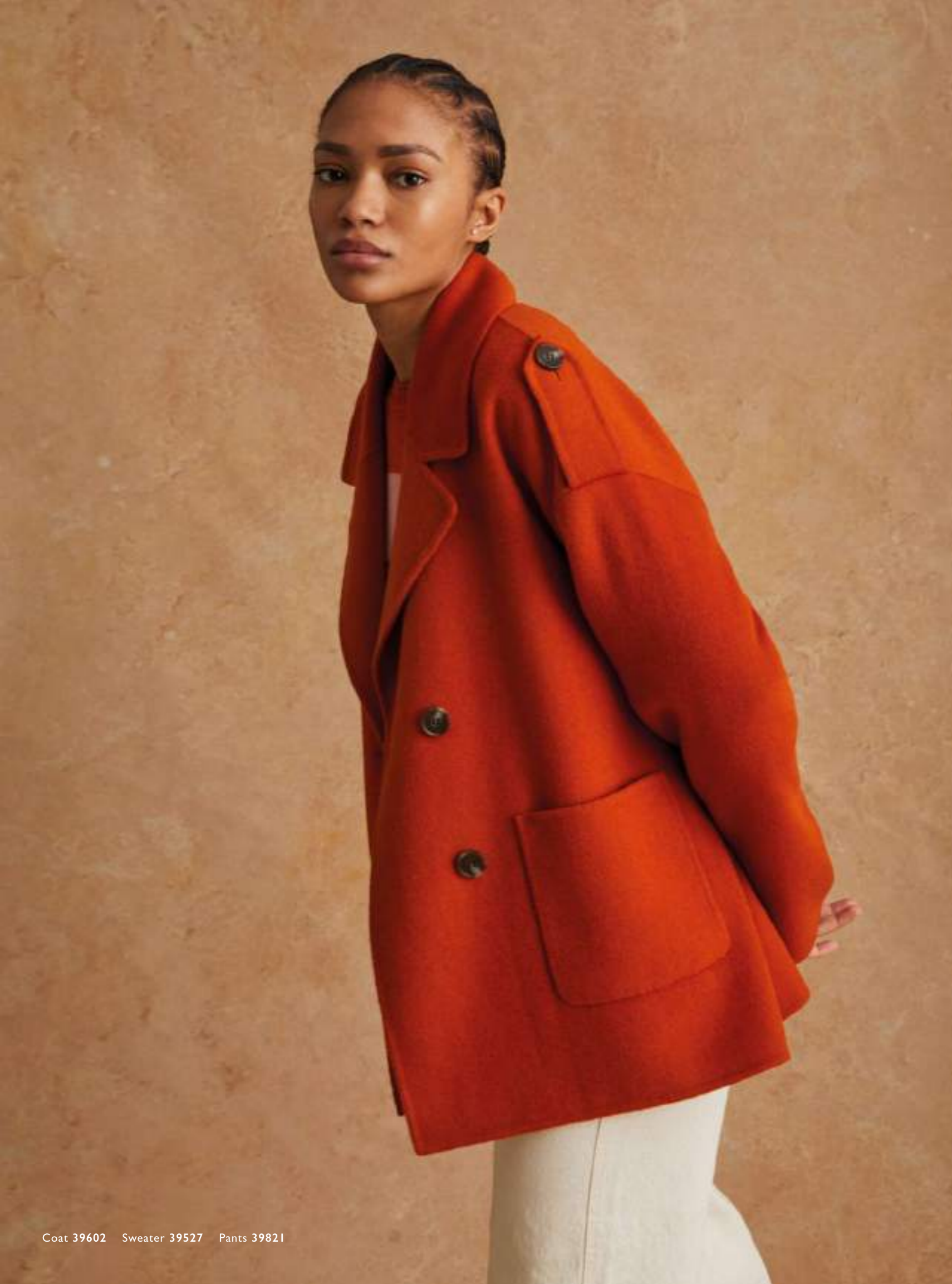
Coat 39602 Sweater 39527 Pants 39821