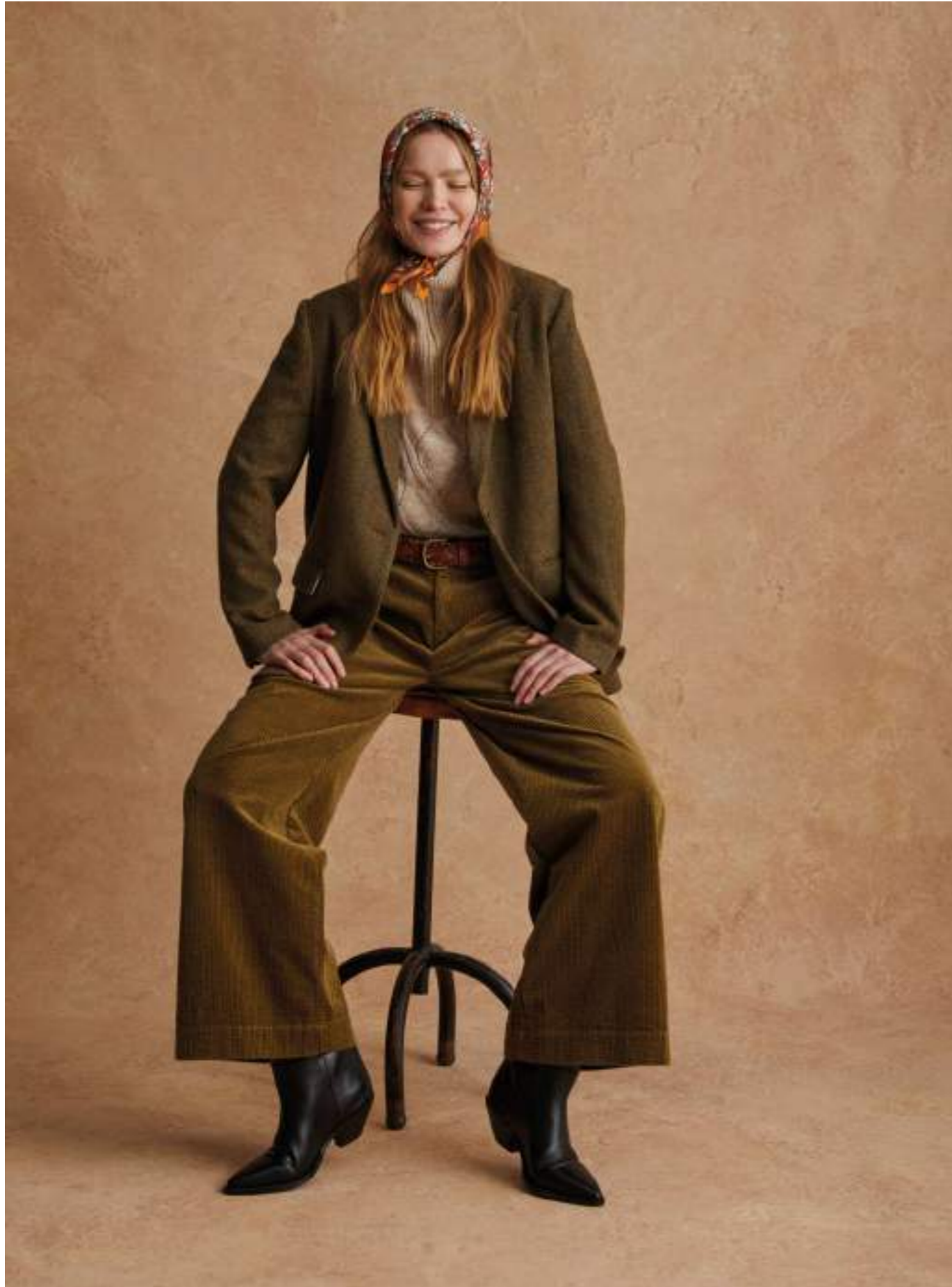
Jacket 39610 Sweater 39567 Pants 39801 Scarf 39907