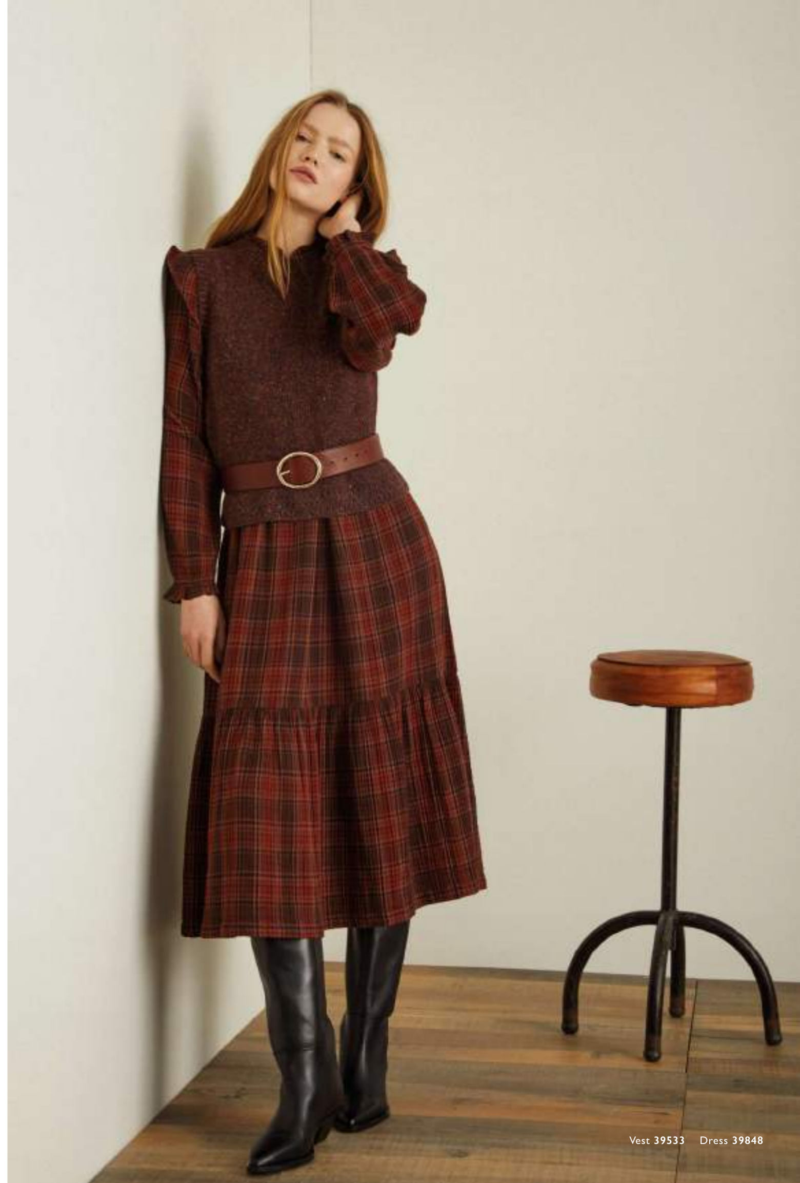
Vest 39533 Dress 39848