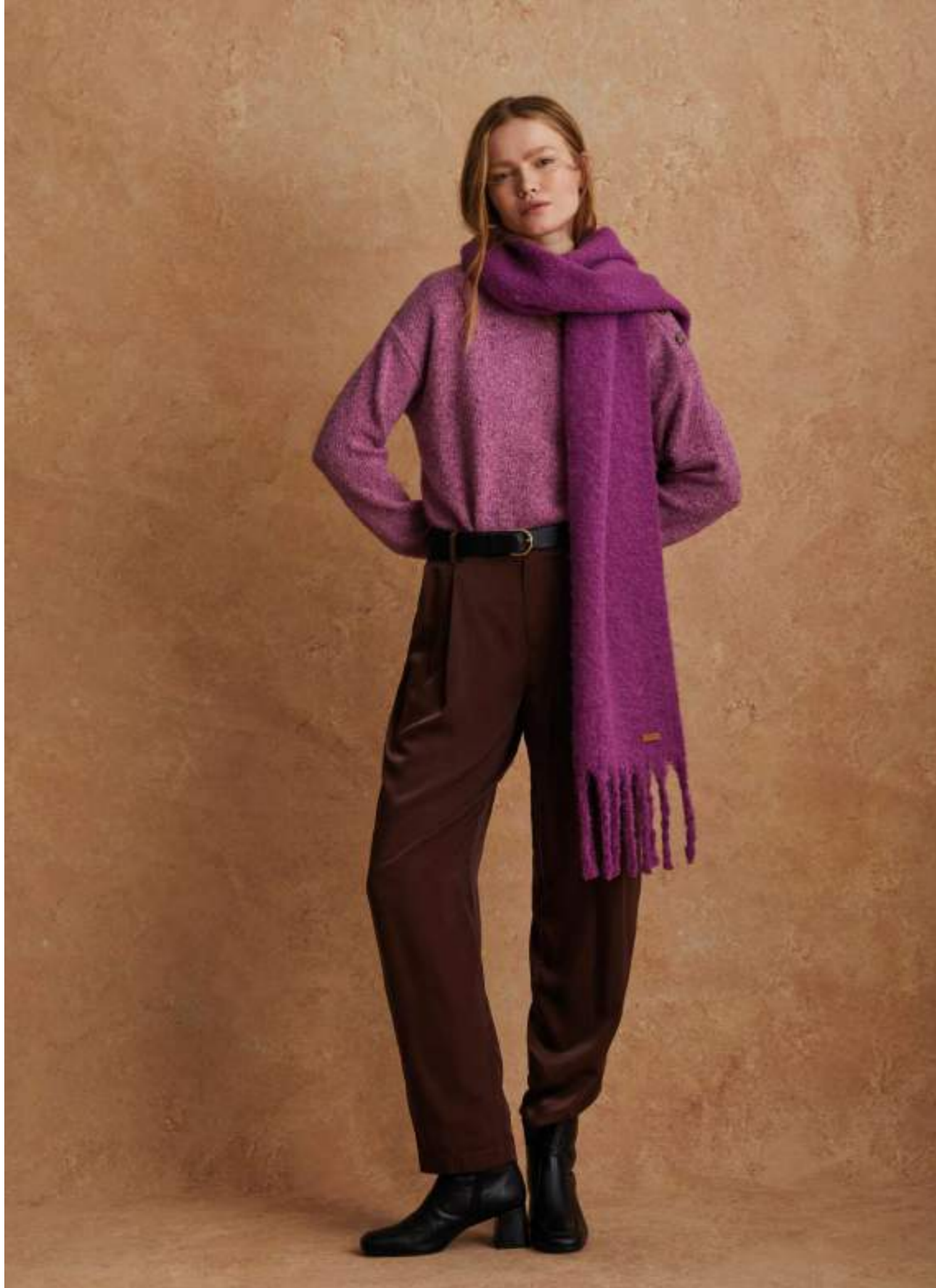
Sweater 39531 | Pants 39868 | Scarf 39912