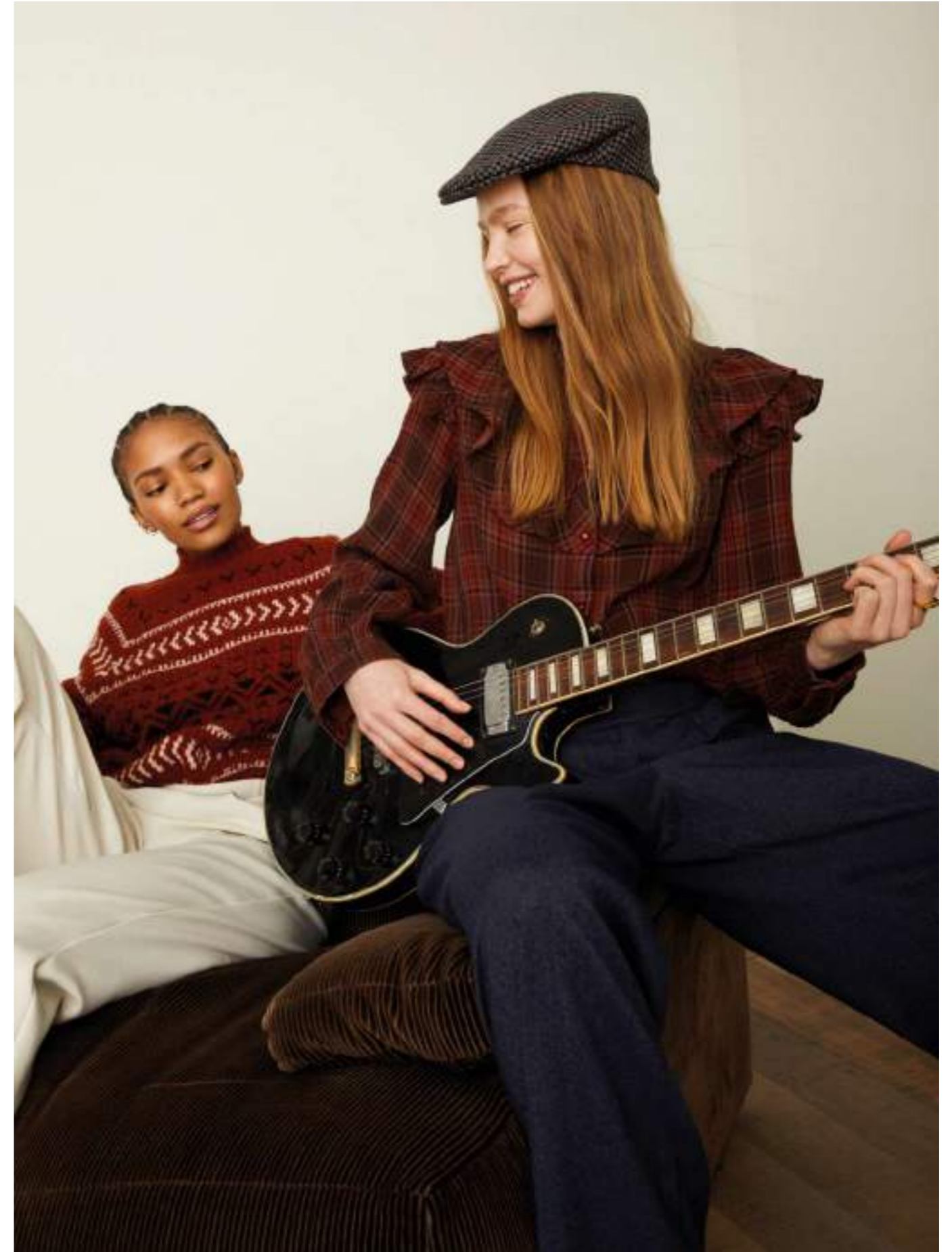
Shirt 39849 Pants 39833