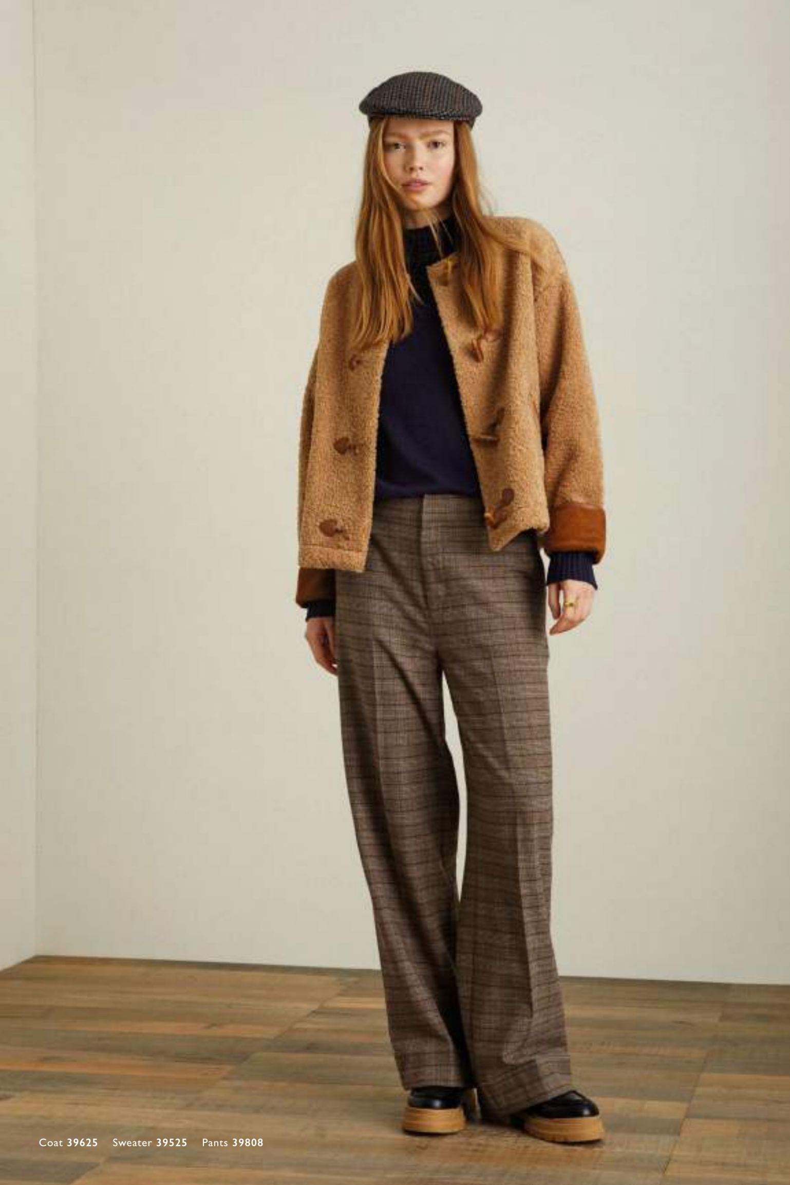
Coat 39625 Sweater 39525 Pants 39808