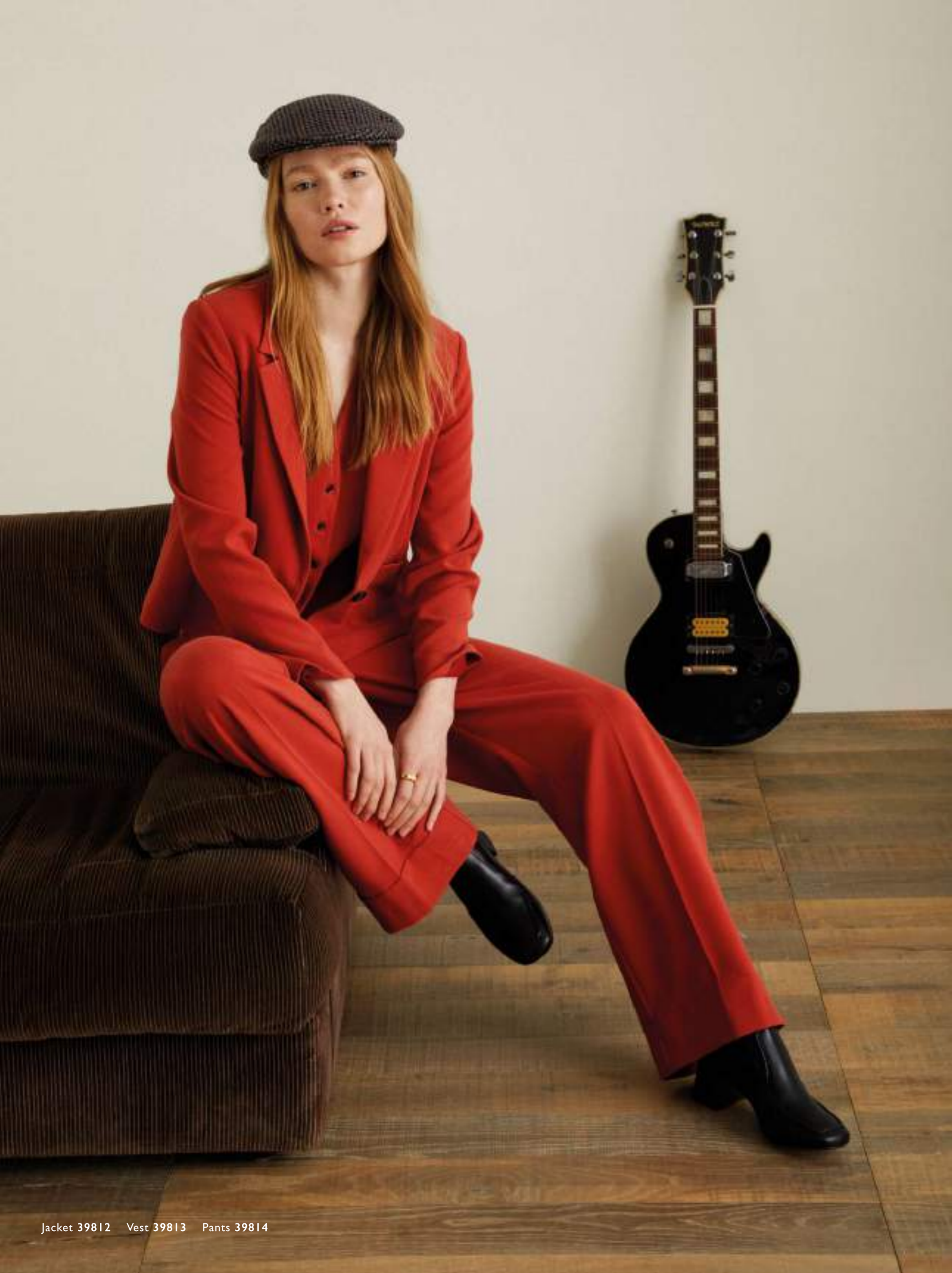
Jacket 39812 Vest 39813 Pants 39814