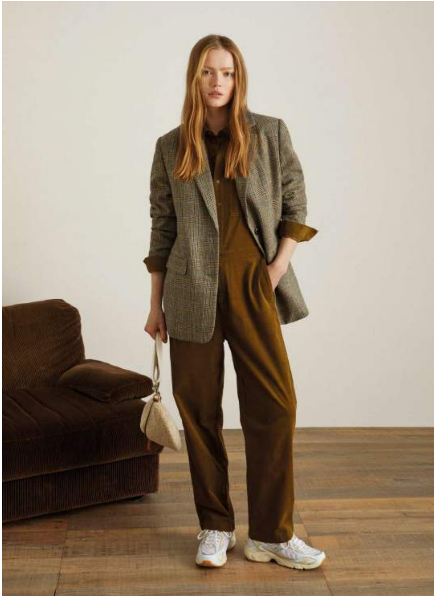
Jacket 39610 Jumpsuit 39859