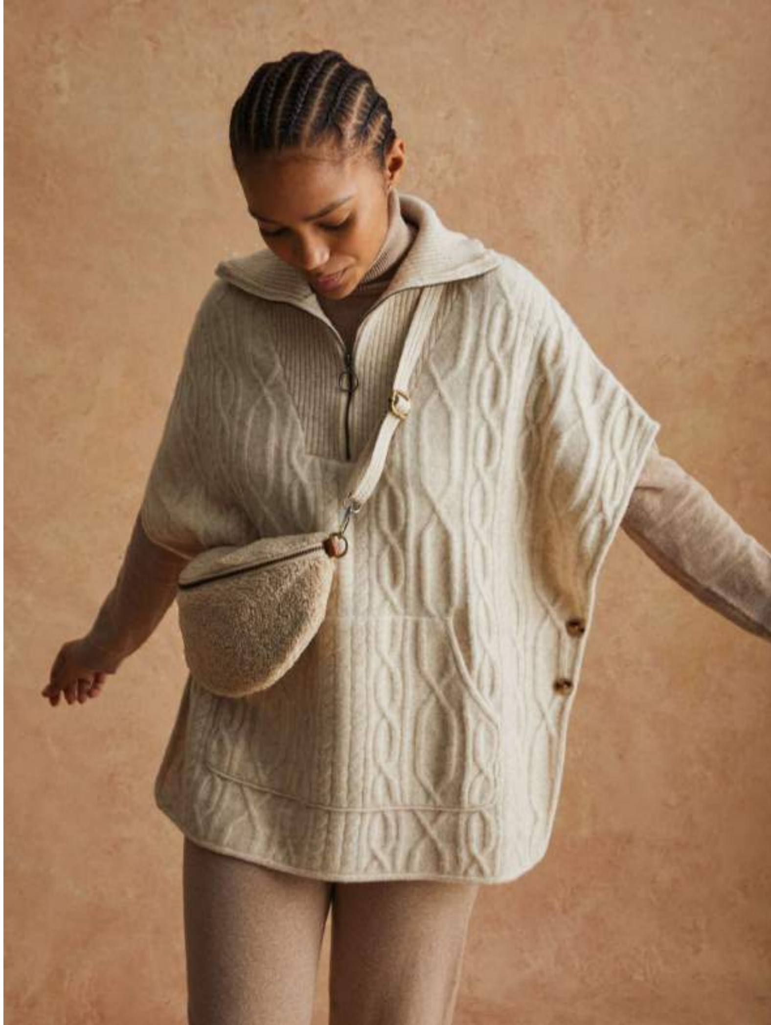
Poncho 39541 | Sweater 39555 | Pants 39557