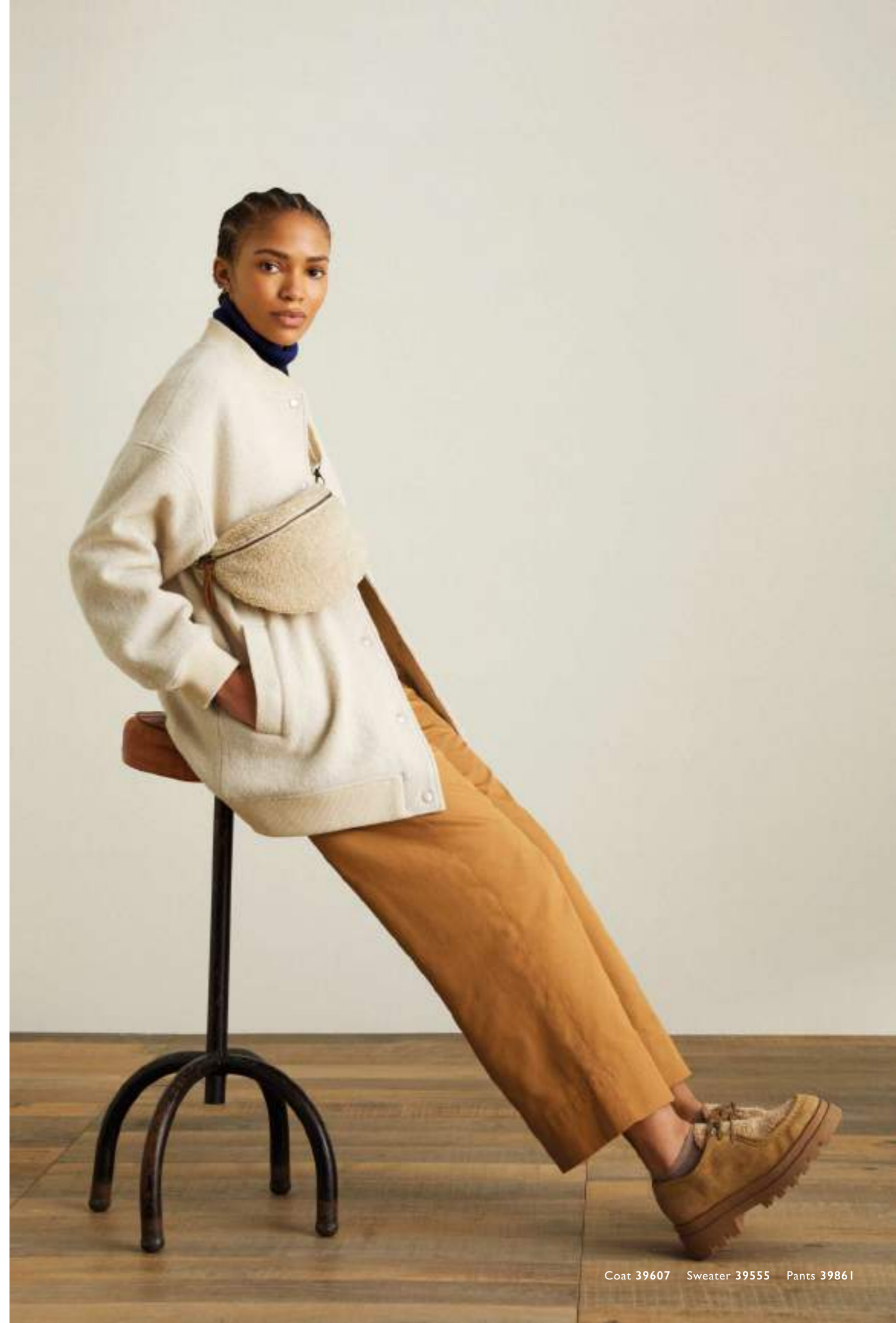
Coat 39607 Sweater 39555 Pants 39861