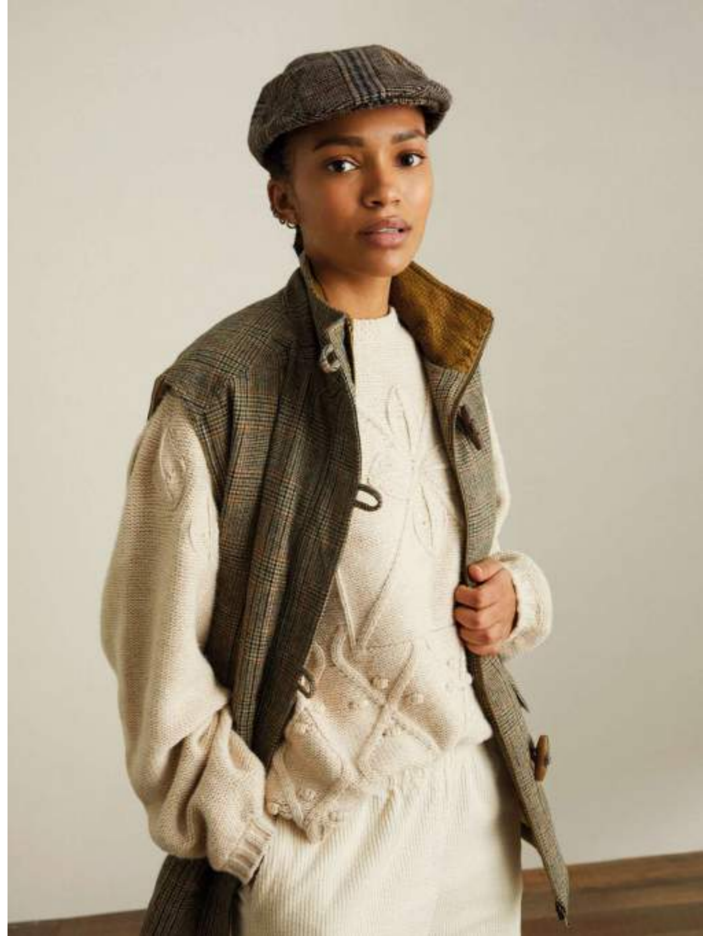
Vest 39612 Sweater 39583 Pants 39802