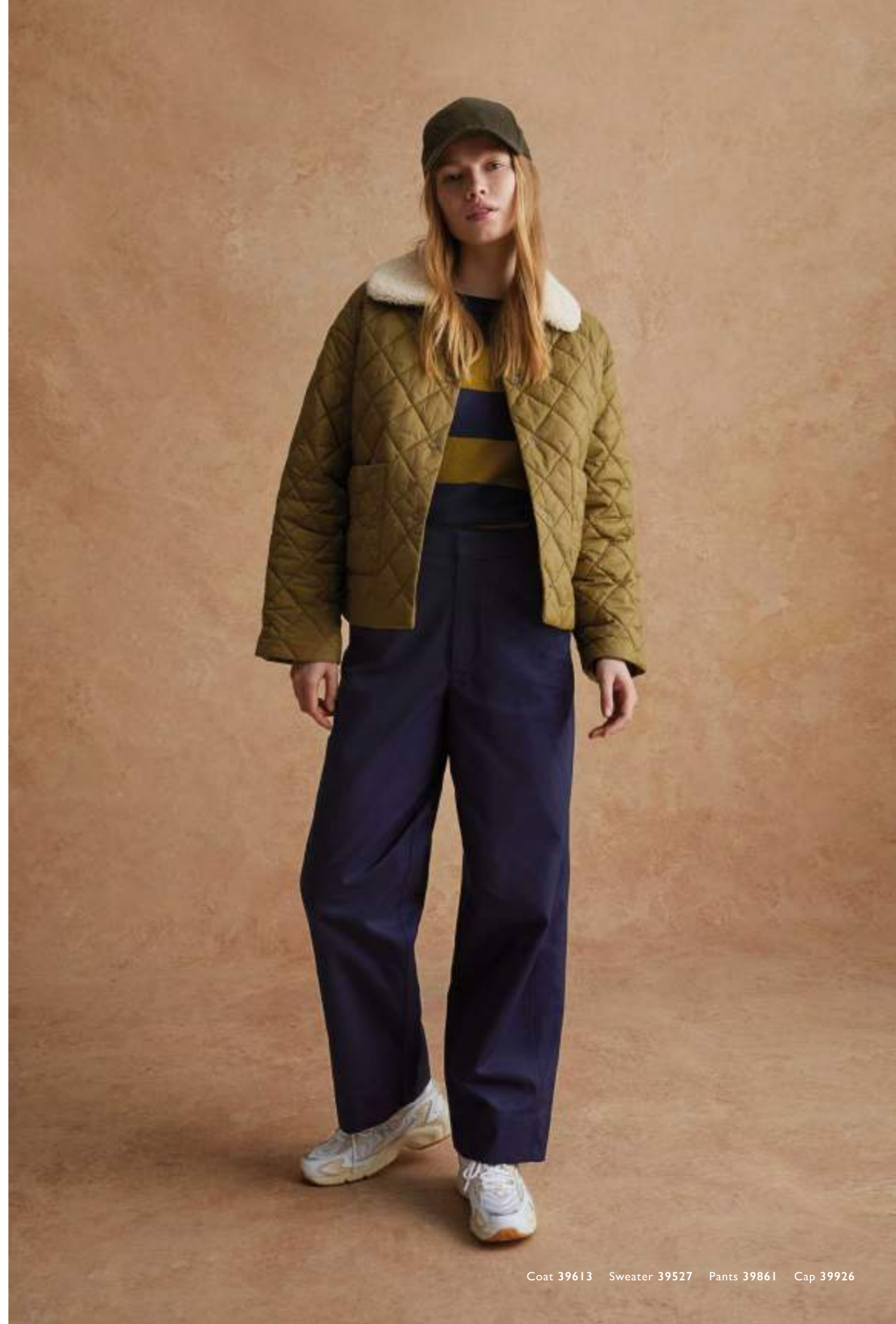
Coat 39613 Sweater 39527 Pants 39861 Cap 39926