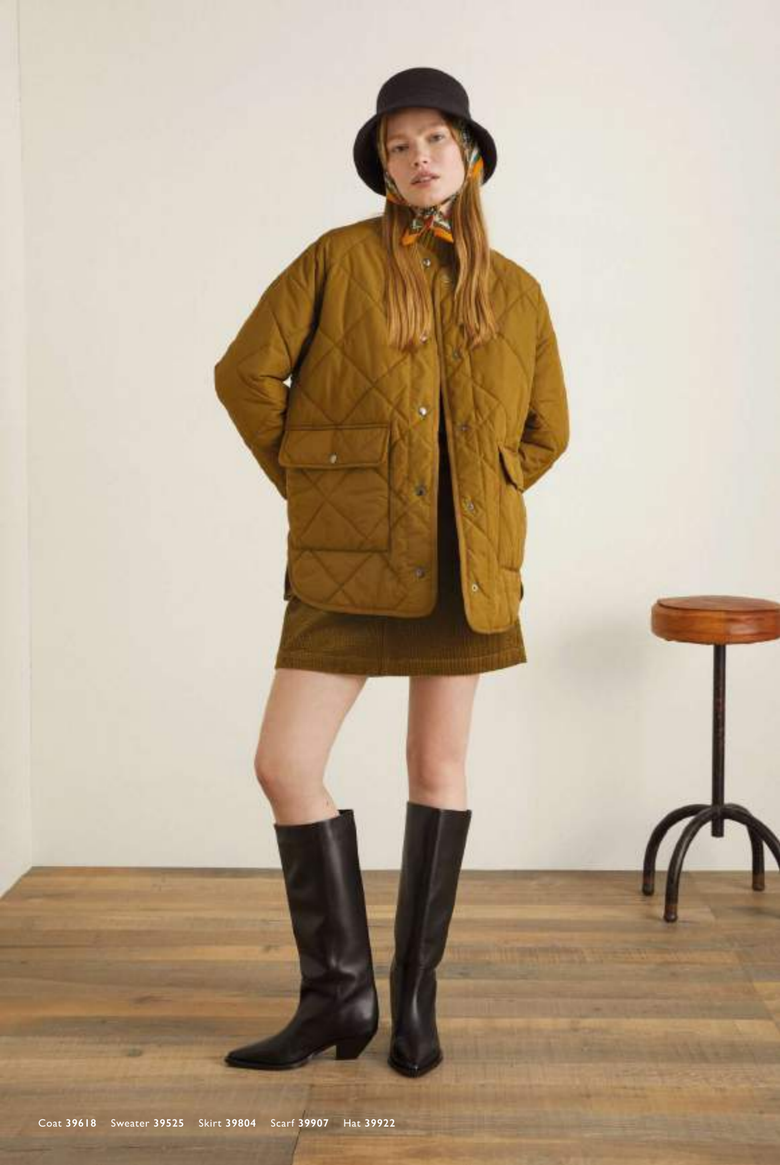
Coat 39618 Sweater 39525 Skirt 39804 Scarf 39907 Hat 39922