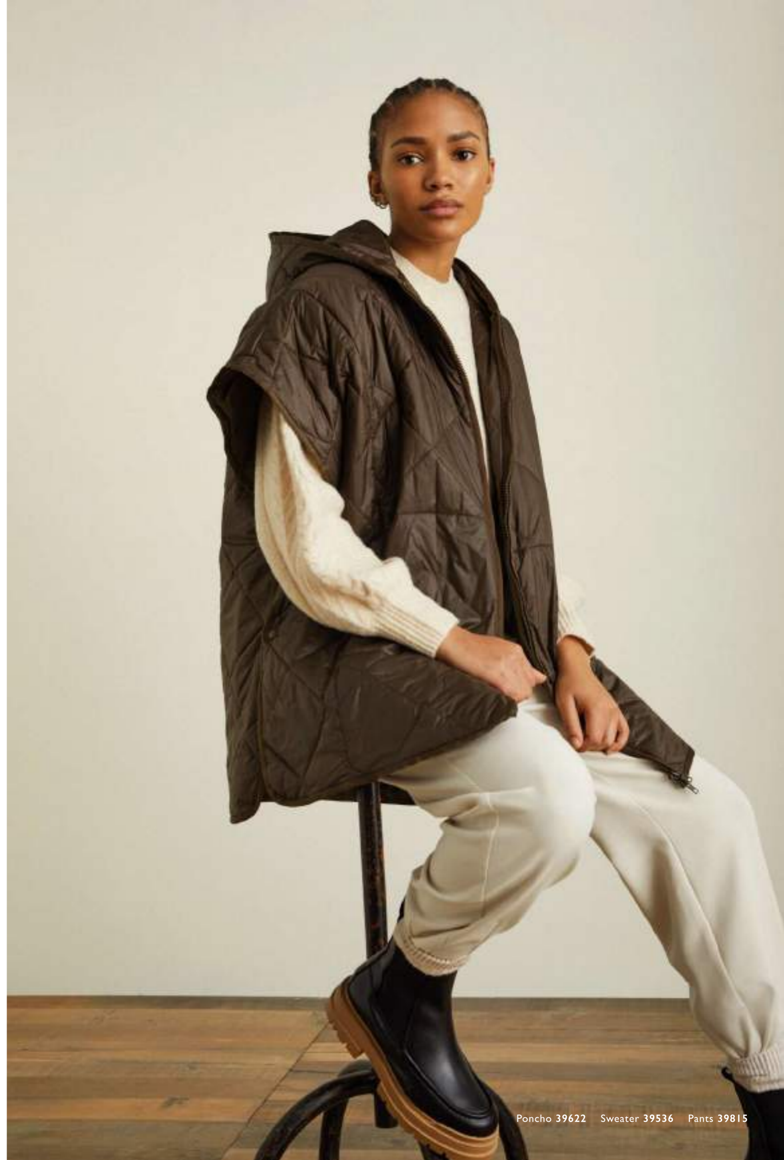
Poncho 39622 Sweater 39536 Pants 39815