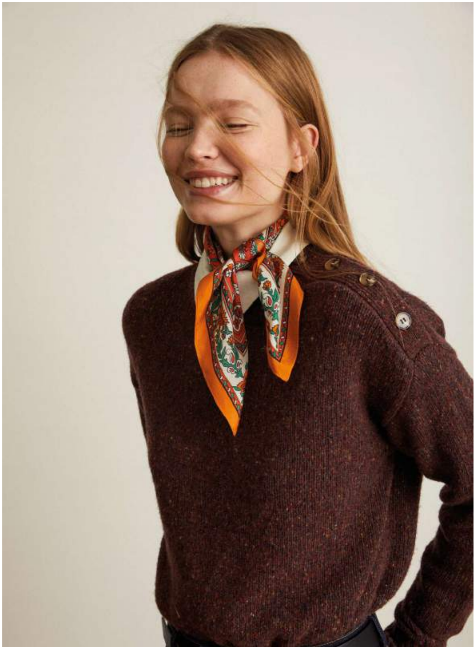
Coat 39627 Sweater 39531 Shirt 39839 Pants 39821 Scarf 39907