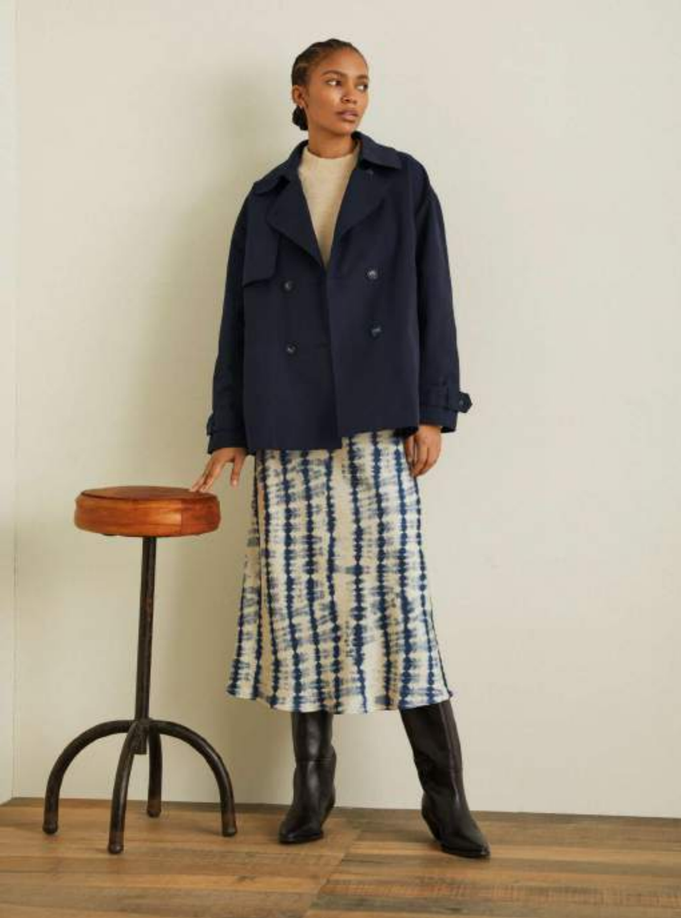
Coat 39628 Sweater 39536 Skirt 39828