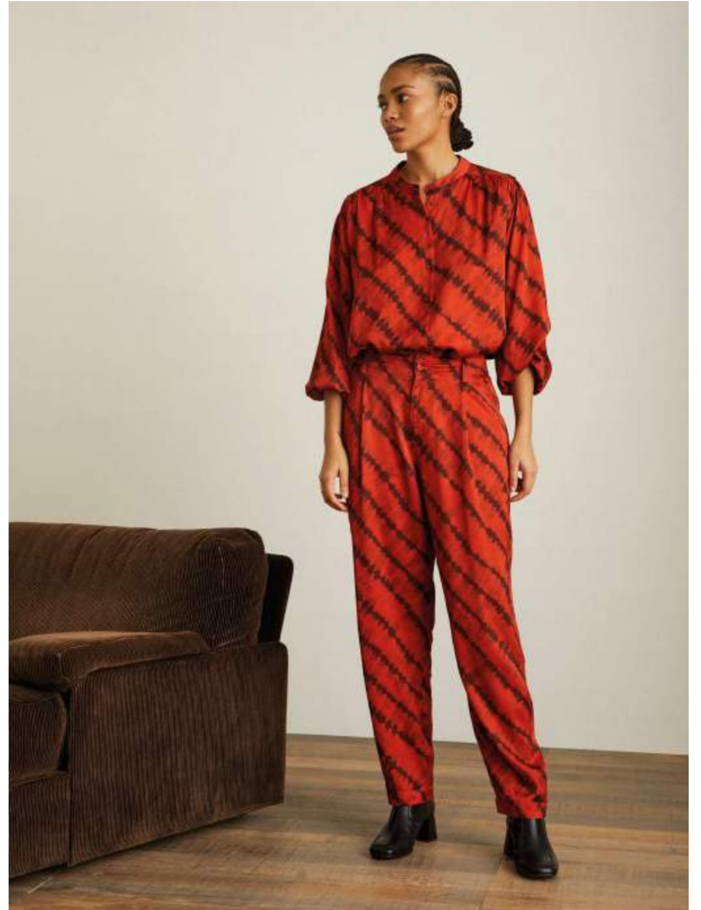
Shirt 39827 Pants 39829