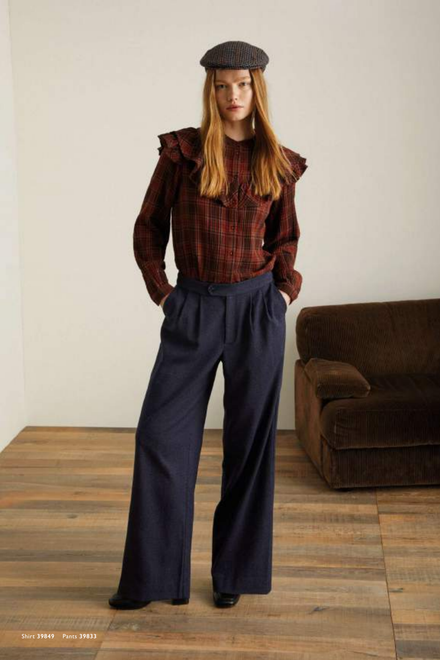
Shirt 39849 Pants 39833