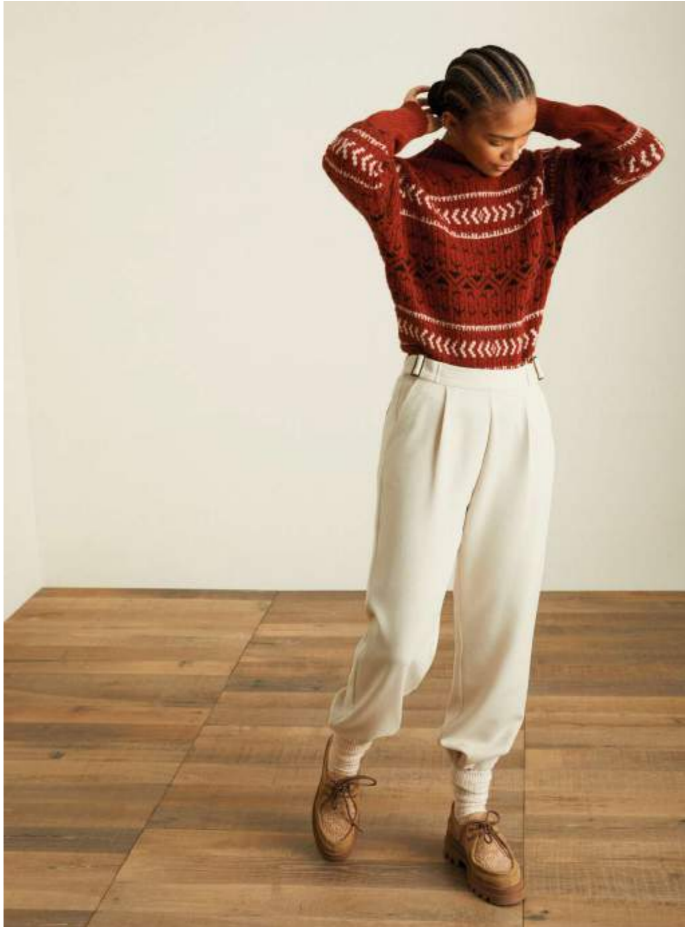
Sweater 39575 Pants 39815