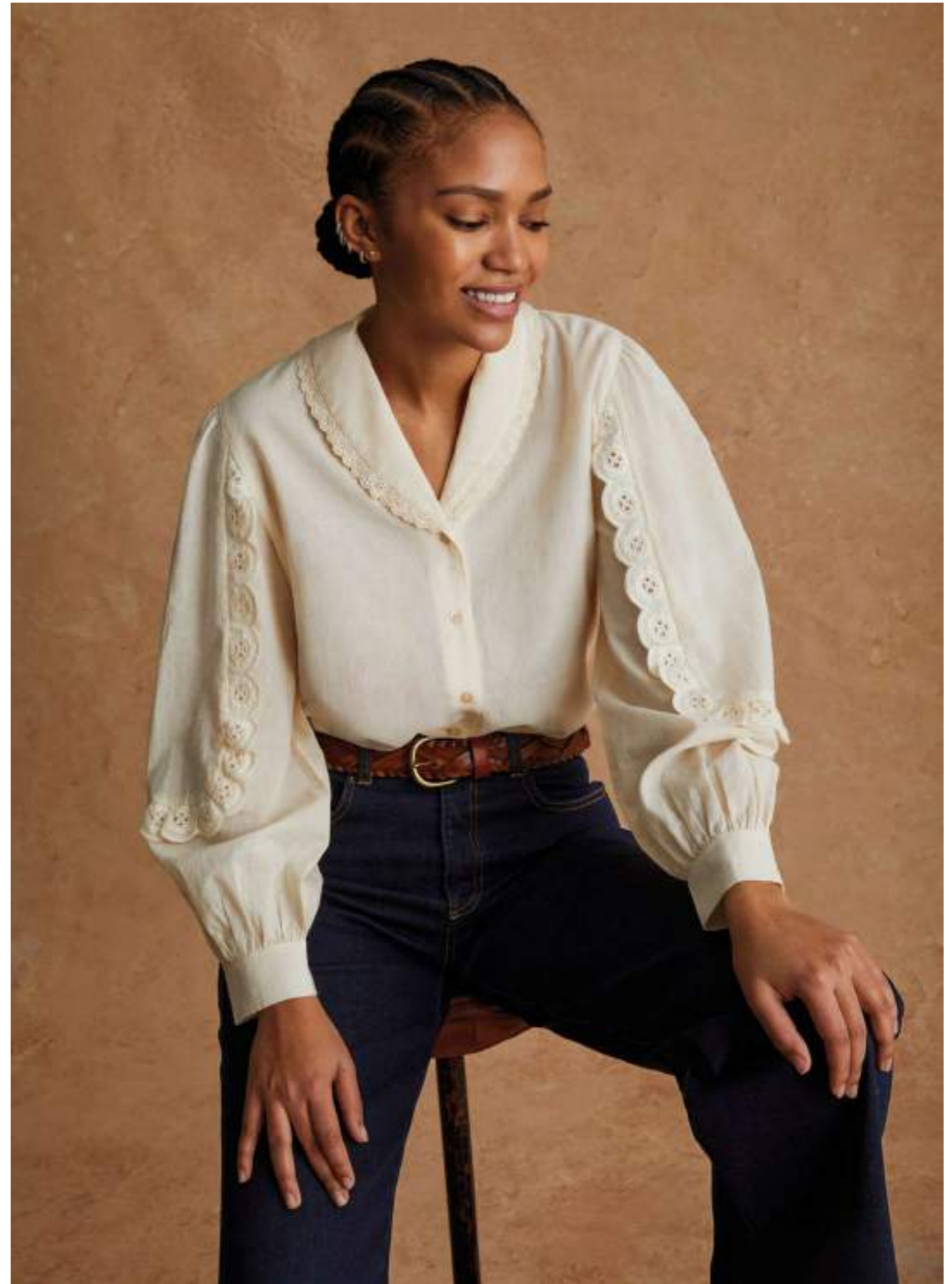
Shirt 39425 Pants 39821