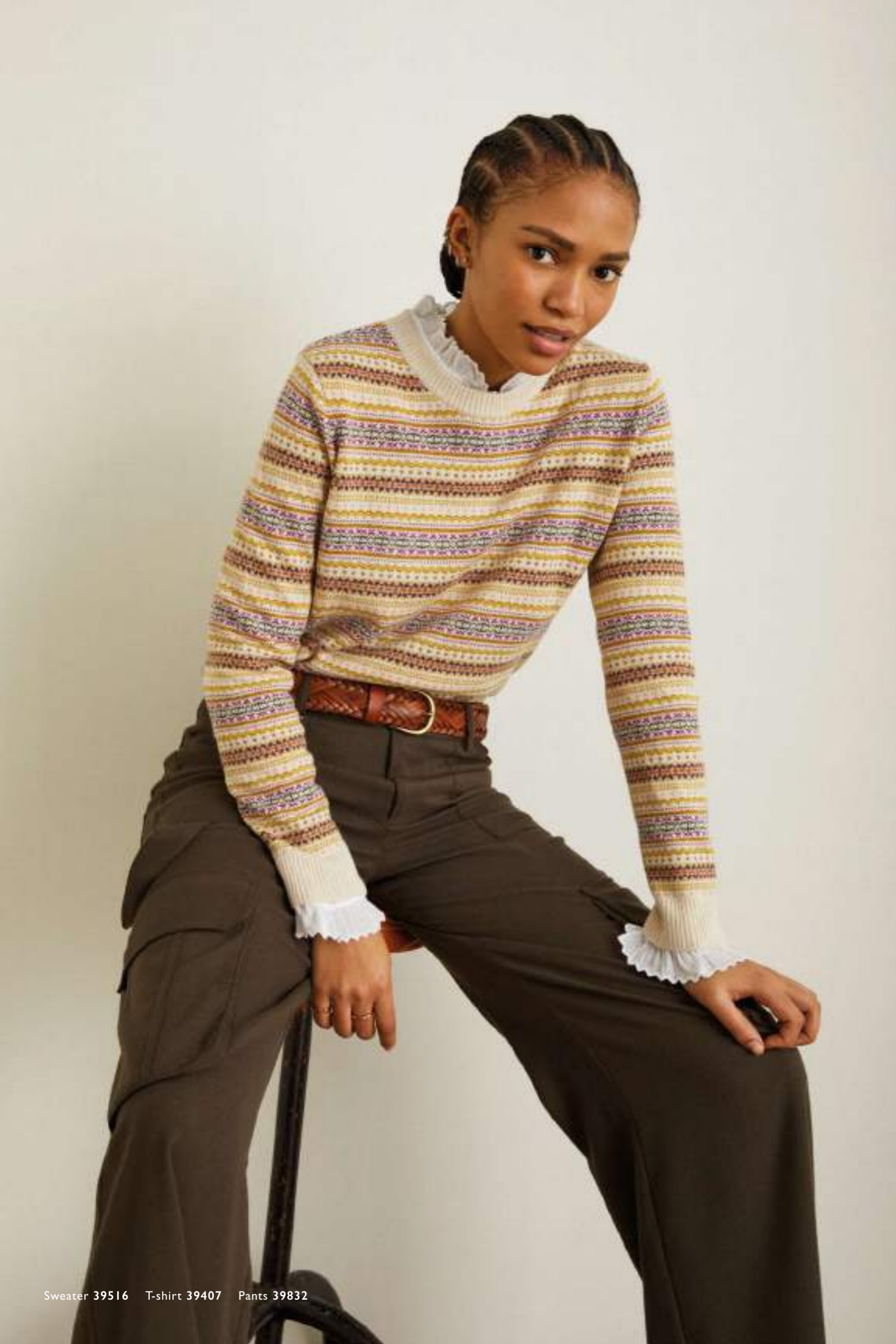
Sweater 39516 T-shirt 39407 Pants 39832