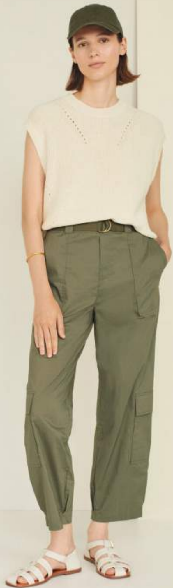
Vest 38536 | Pants 38831 | Cap 38925 | Belt 38933