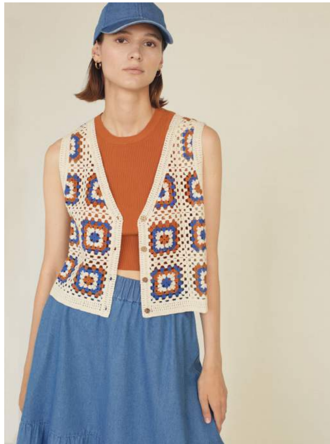
Vest 38547 Top 38519 Skirt 38827 Cap 38925