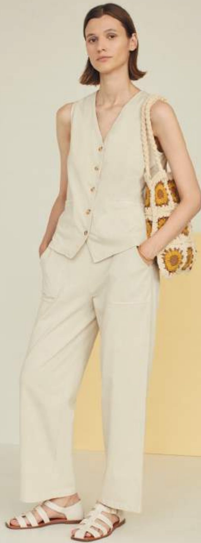
Vest 38220 Pants 38222 Bag 38934