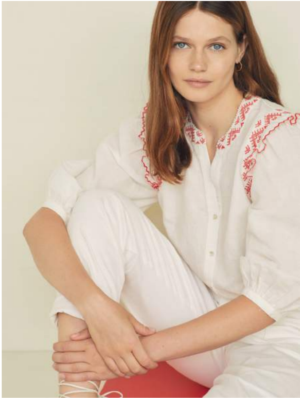
Shirt 38266 Pants 38802