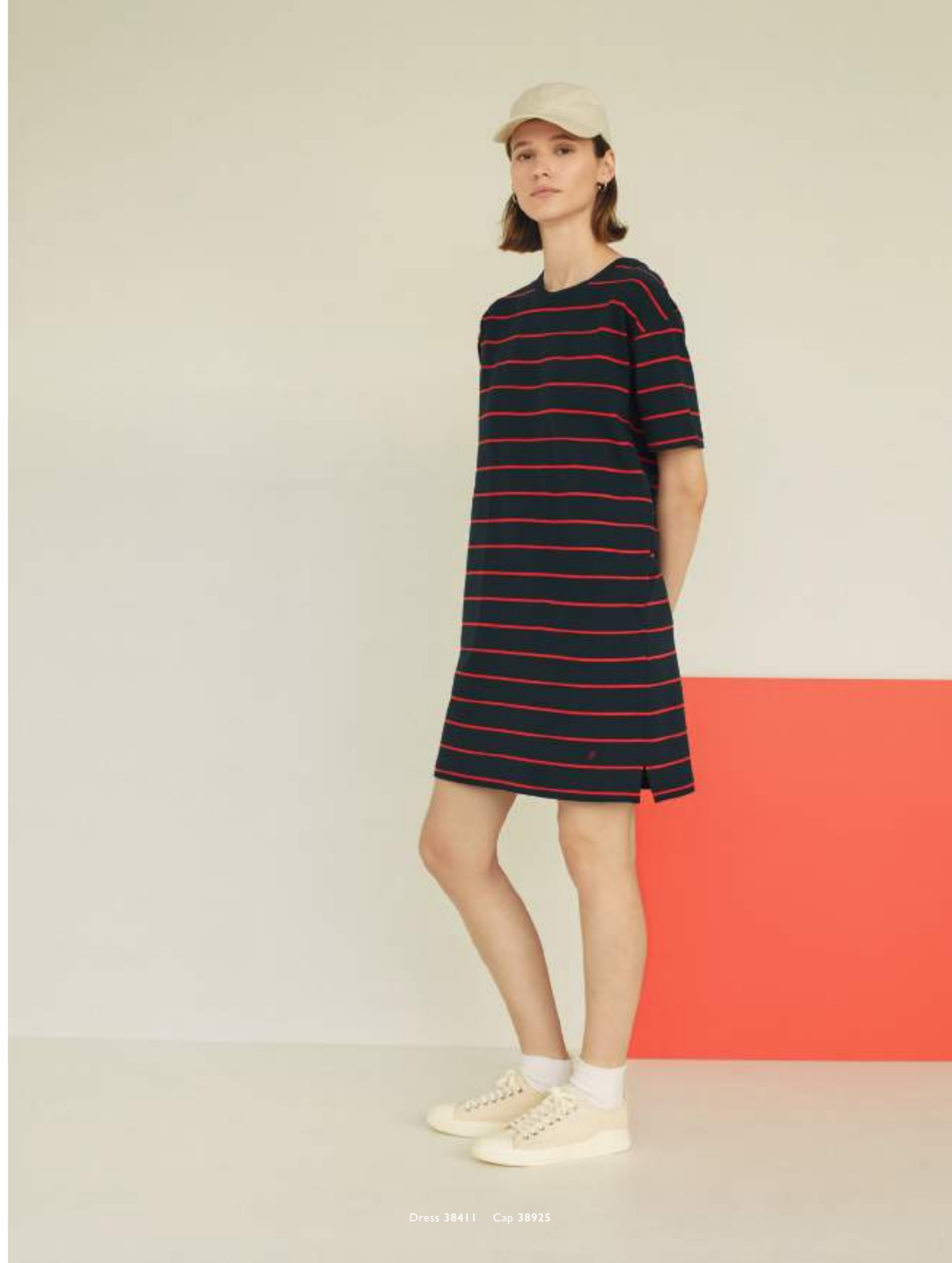
Dress 38411 Cap 38925