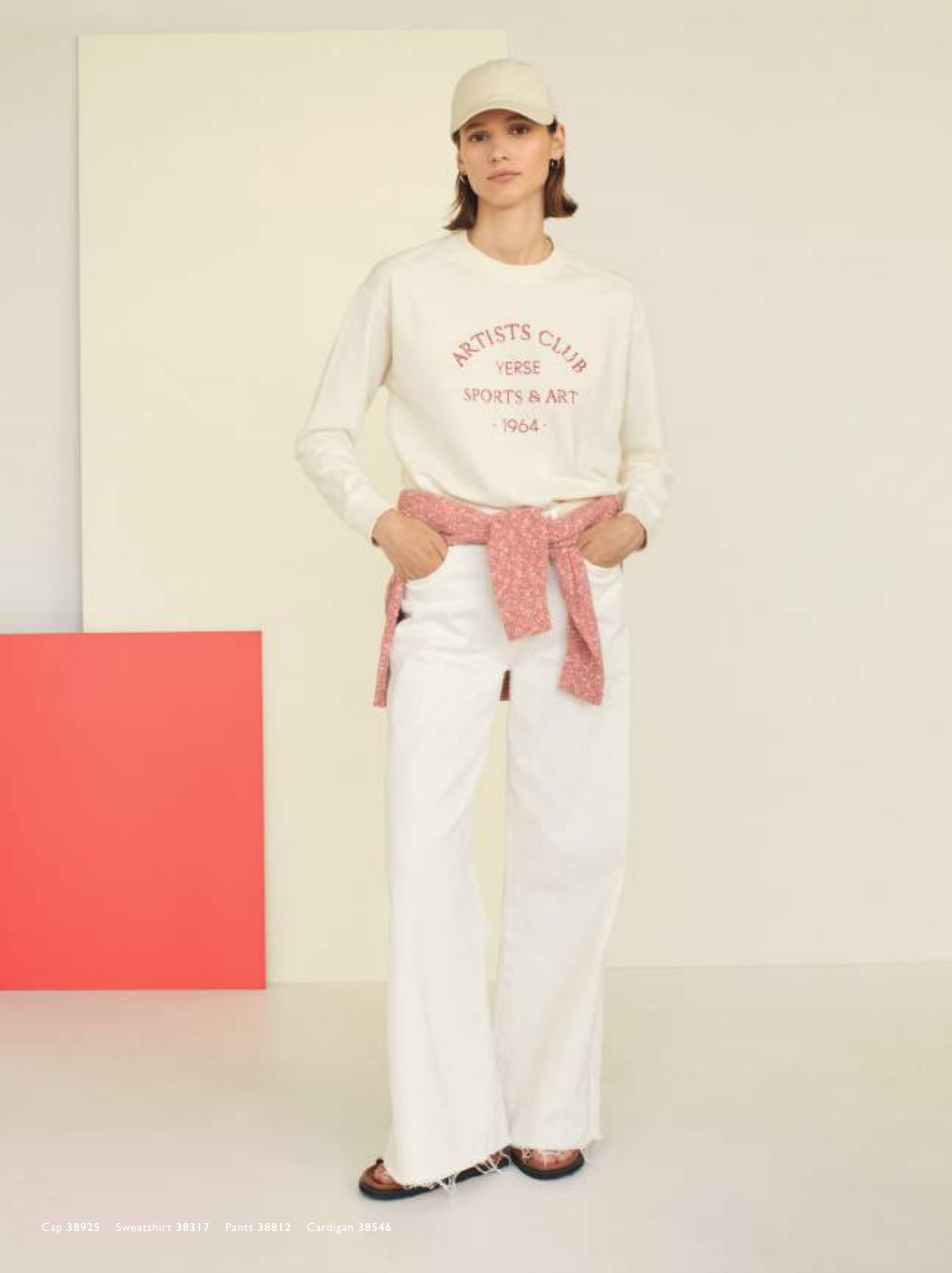
Cap 38925 Sweatshirt 38317 Pants 38812 Cardigan 38546