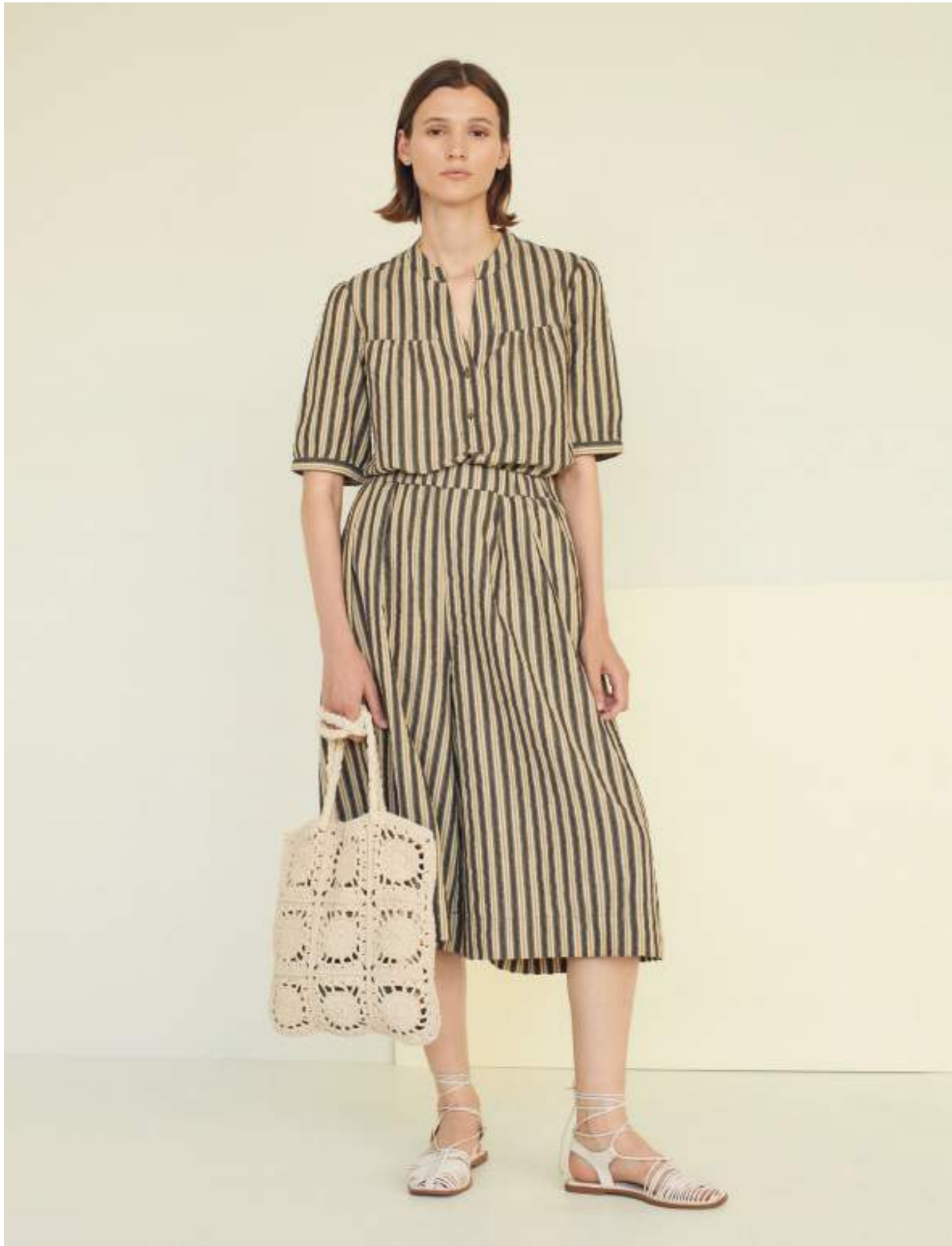
Shirt 38850 | Pants 38851 | Bag 38934