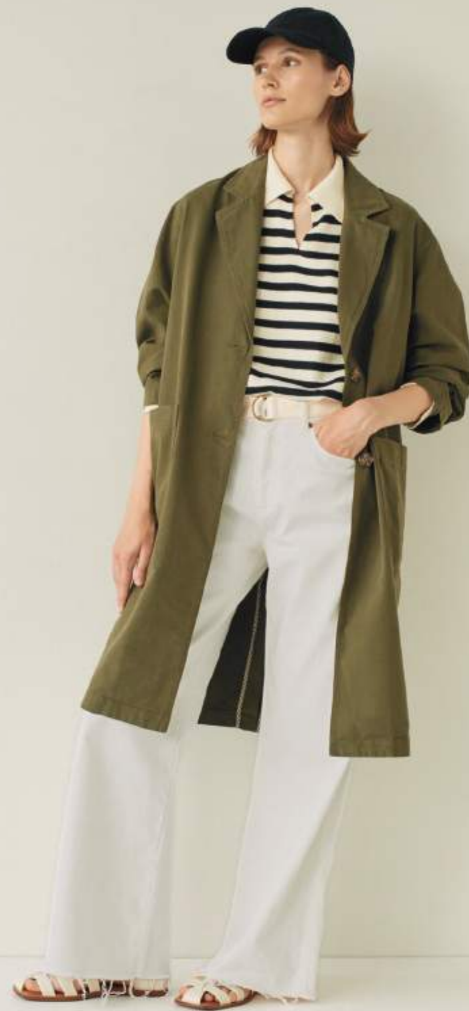
Jacket 38601 | Sweater 38534 | Pants 38812 | Cap 38925 | Belt 38933