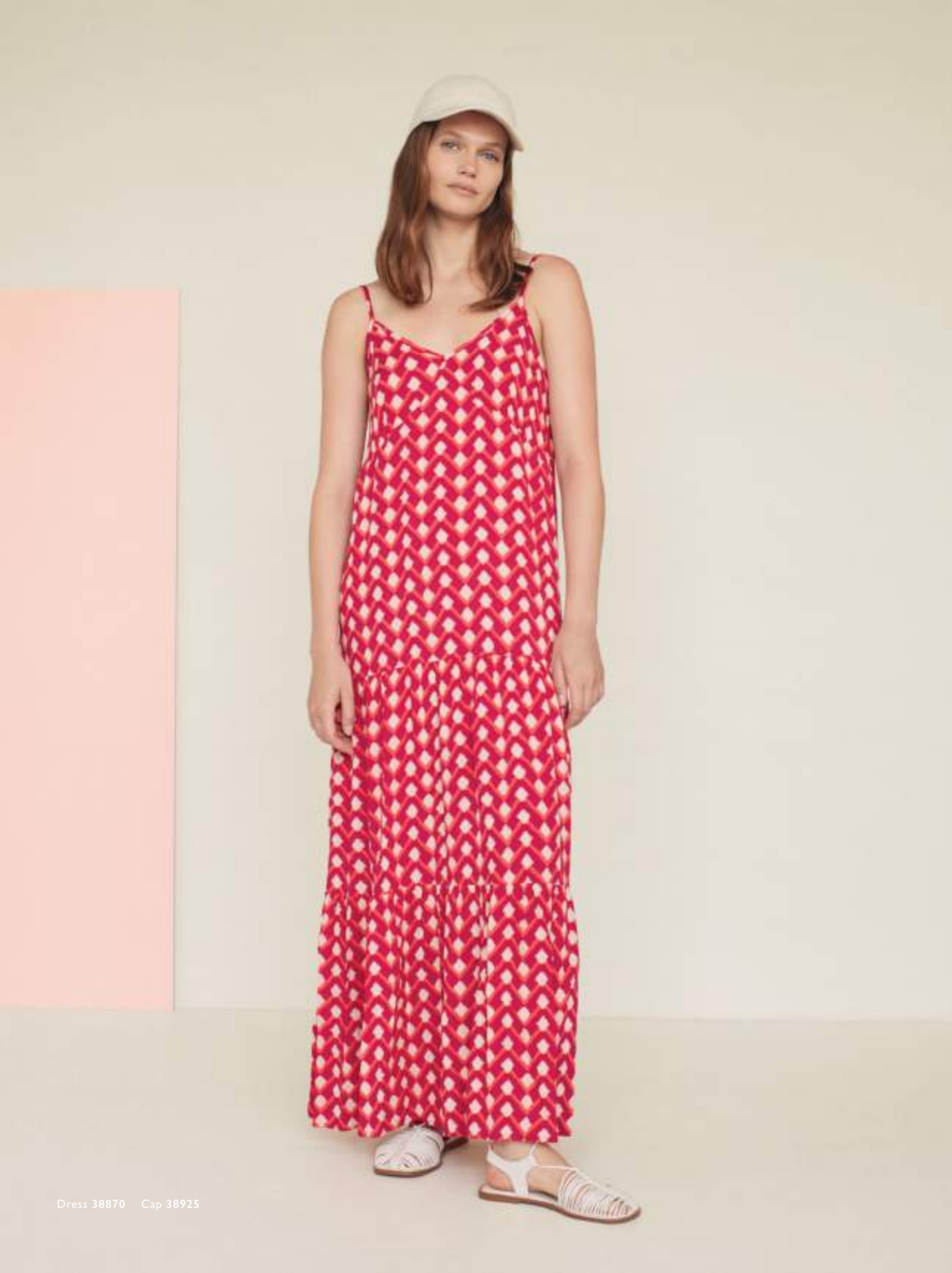
Dress 38870 Cap 38925