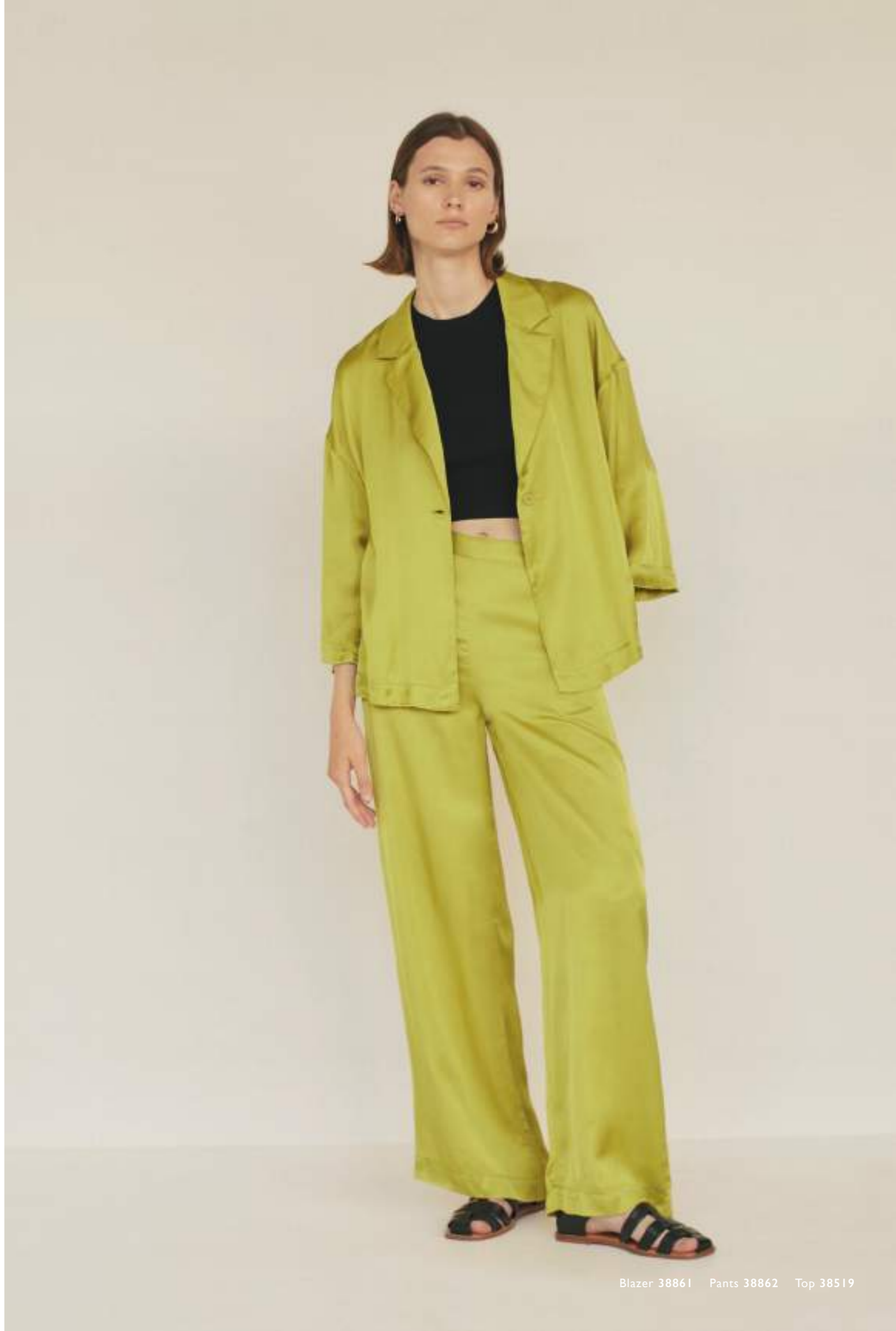
Blazer 38861 | Pants 38862 | Top 38519