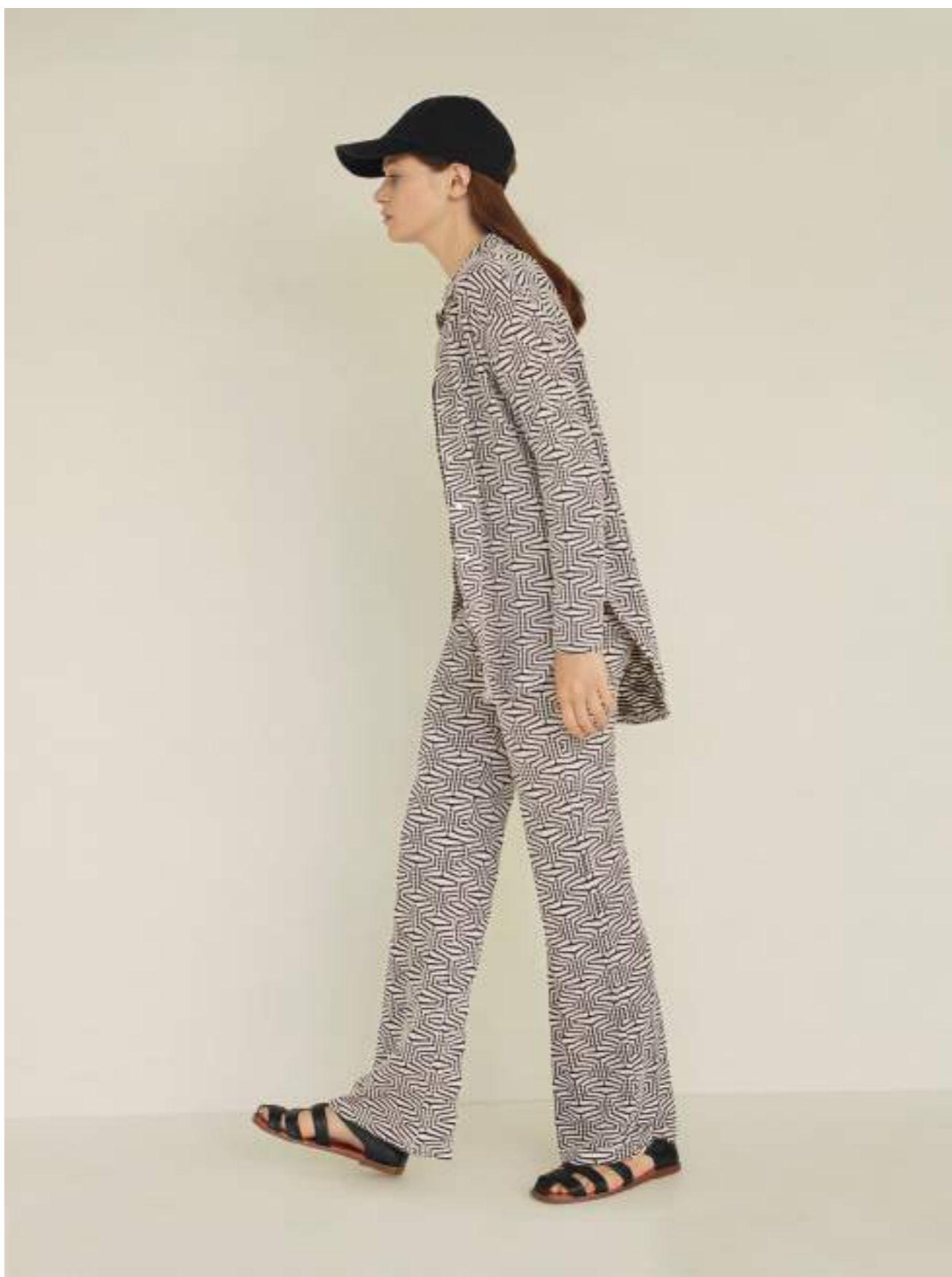
Cap 38925 Shirt 38123 Top 38519 Pants 38121