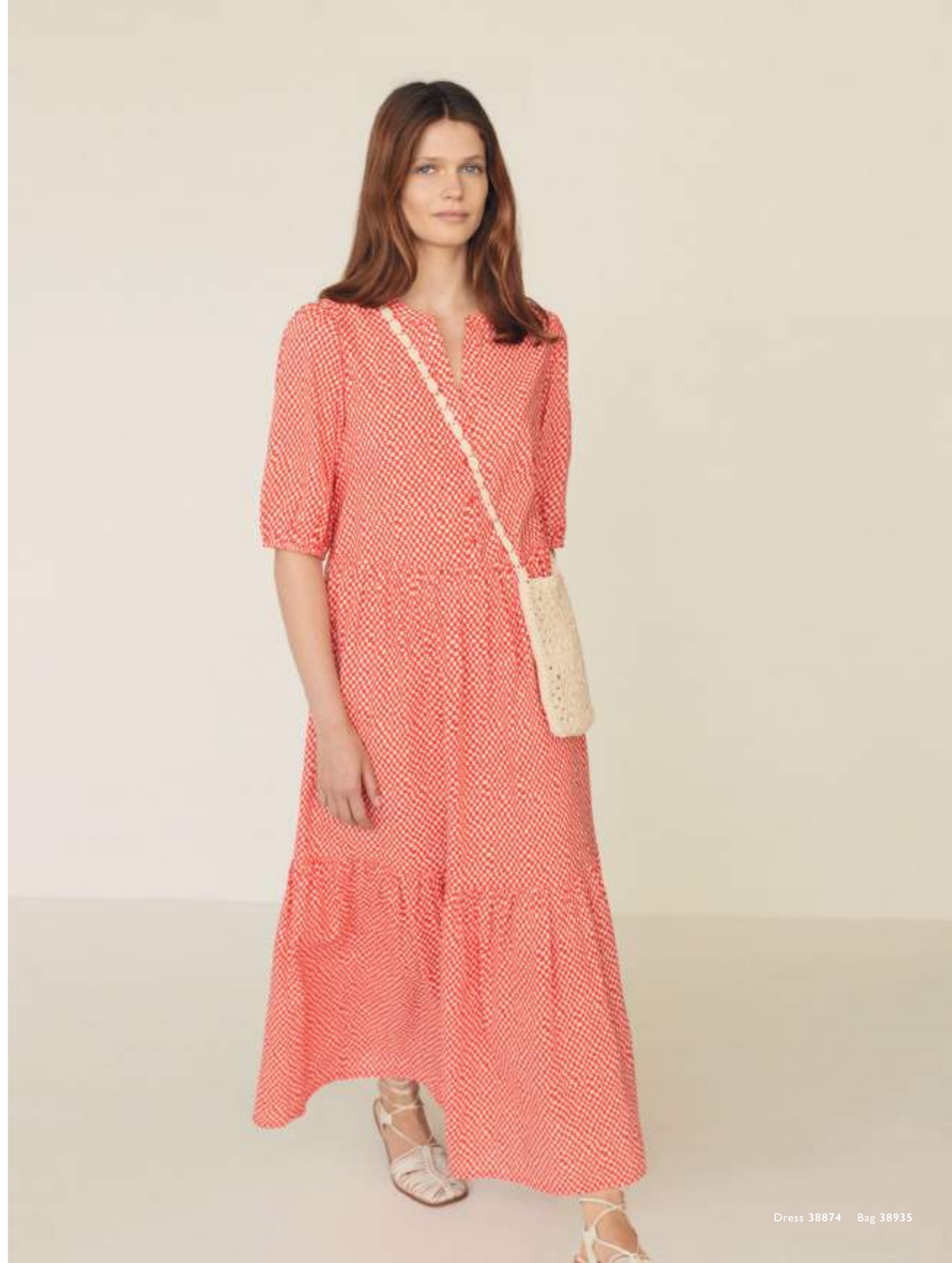
Dress 38874 Bag 38935