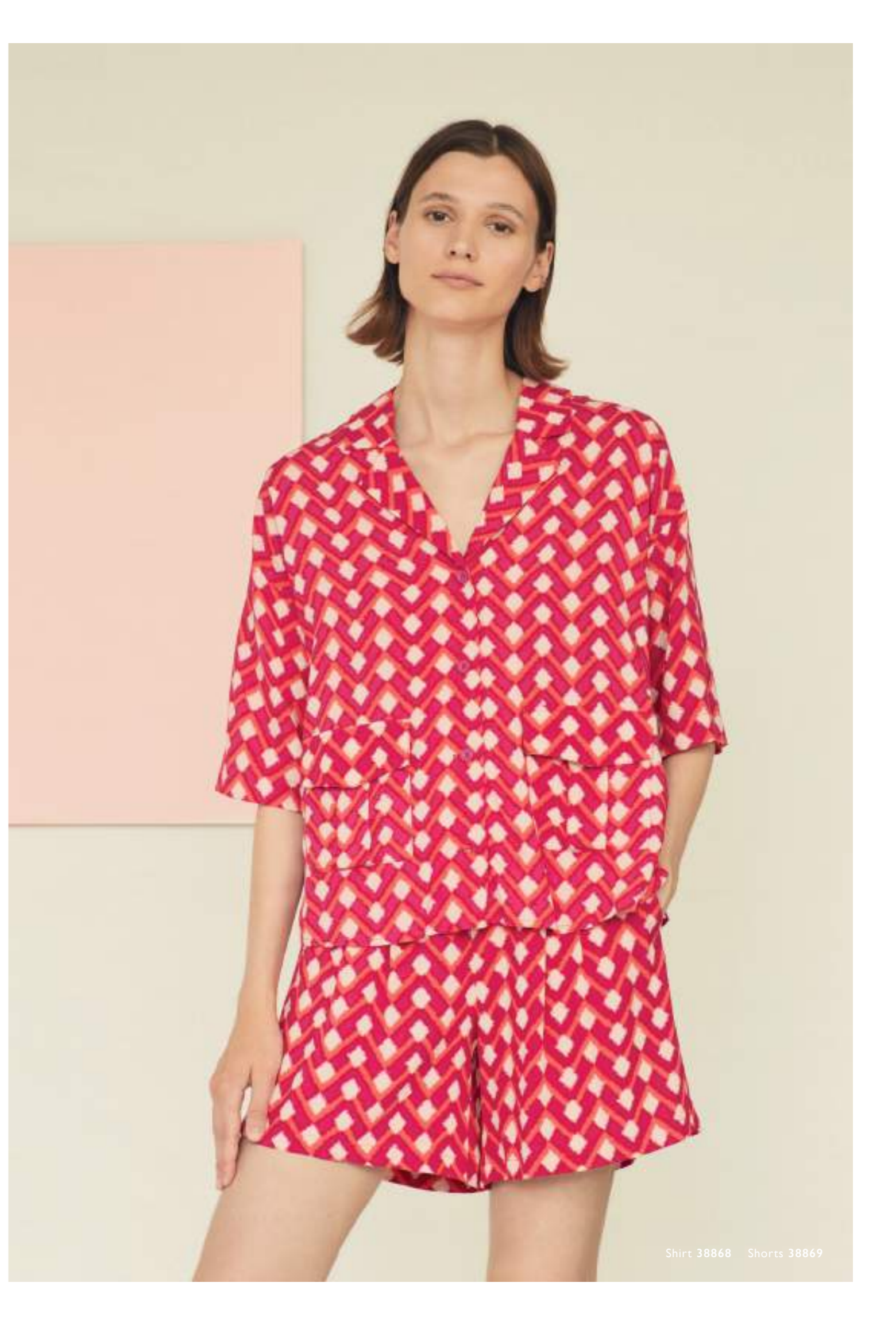
Shirt 38868 Shorts 38869