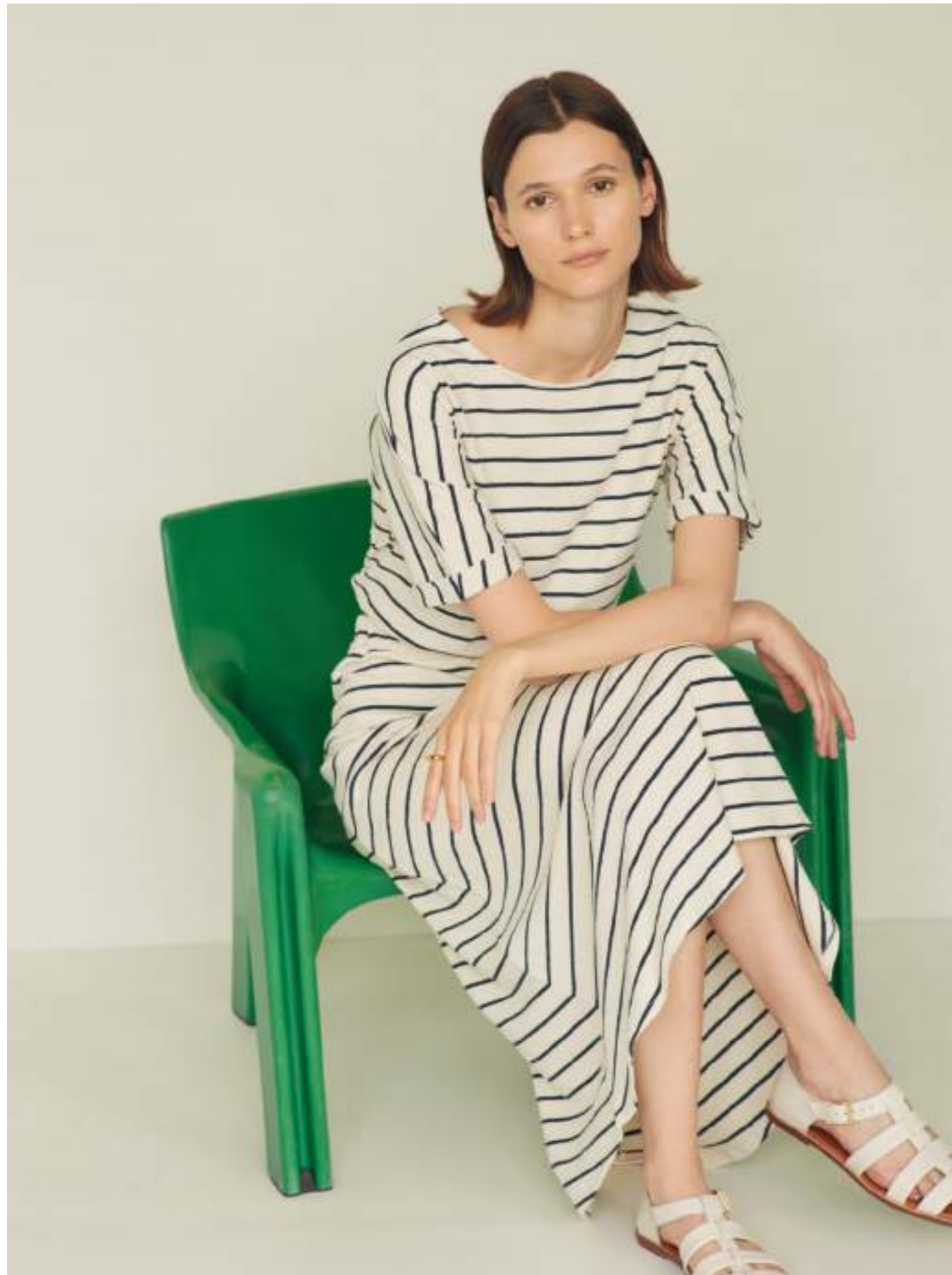
T-shirt 38370 Skirt 38371