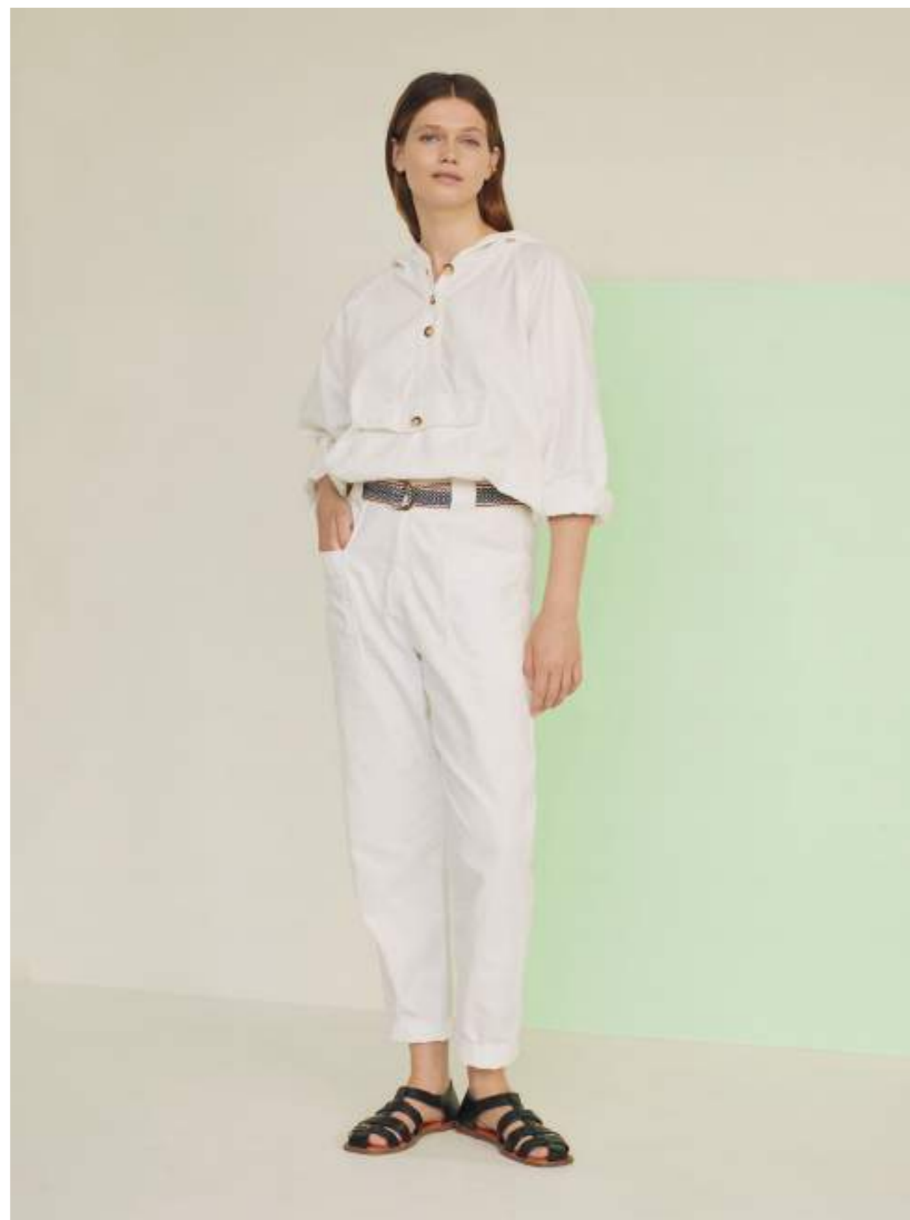
Sweatshirt 38800 Pants 38802 Belt 38932