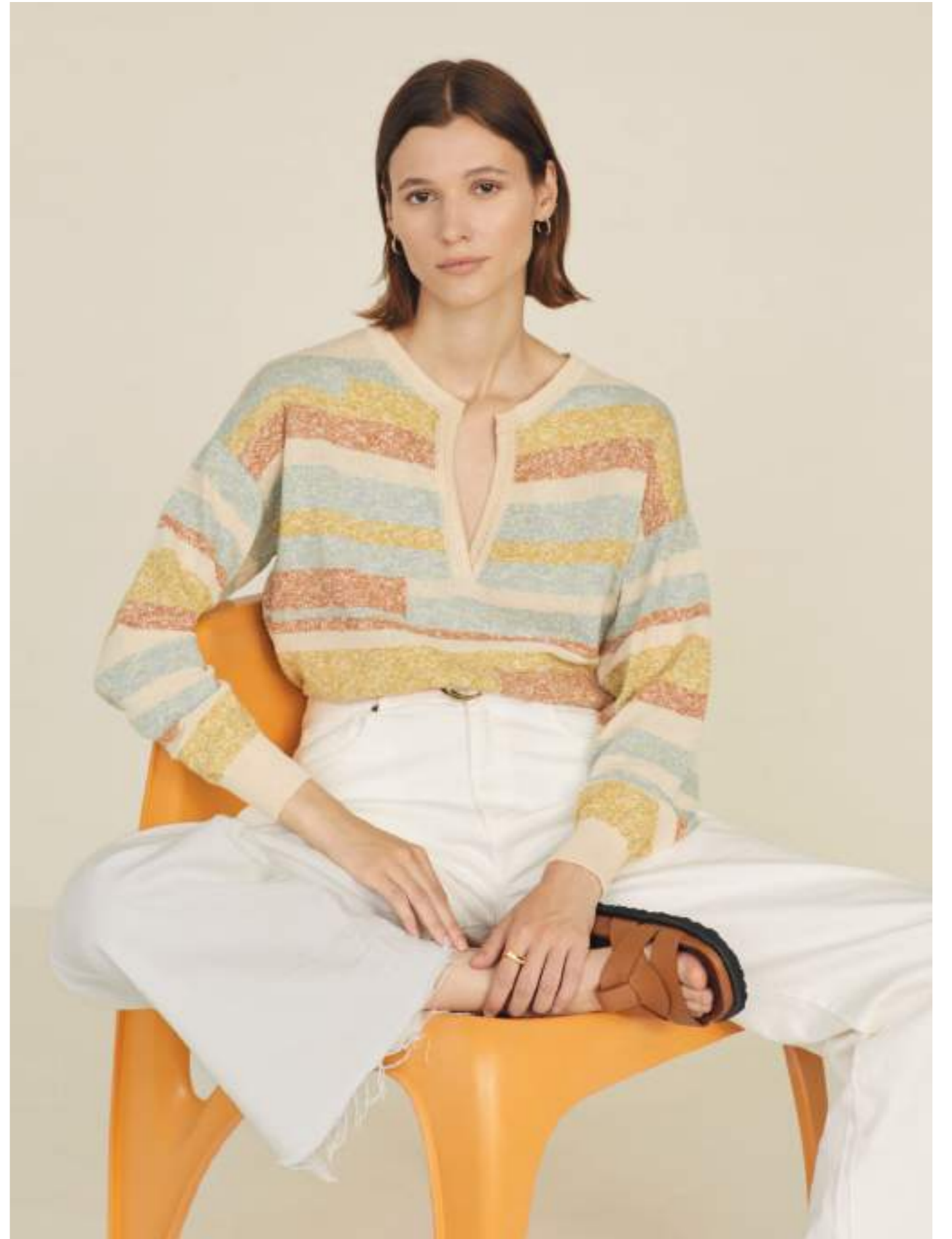
Sweater 38545 Pants 38812