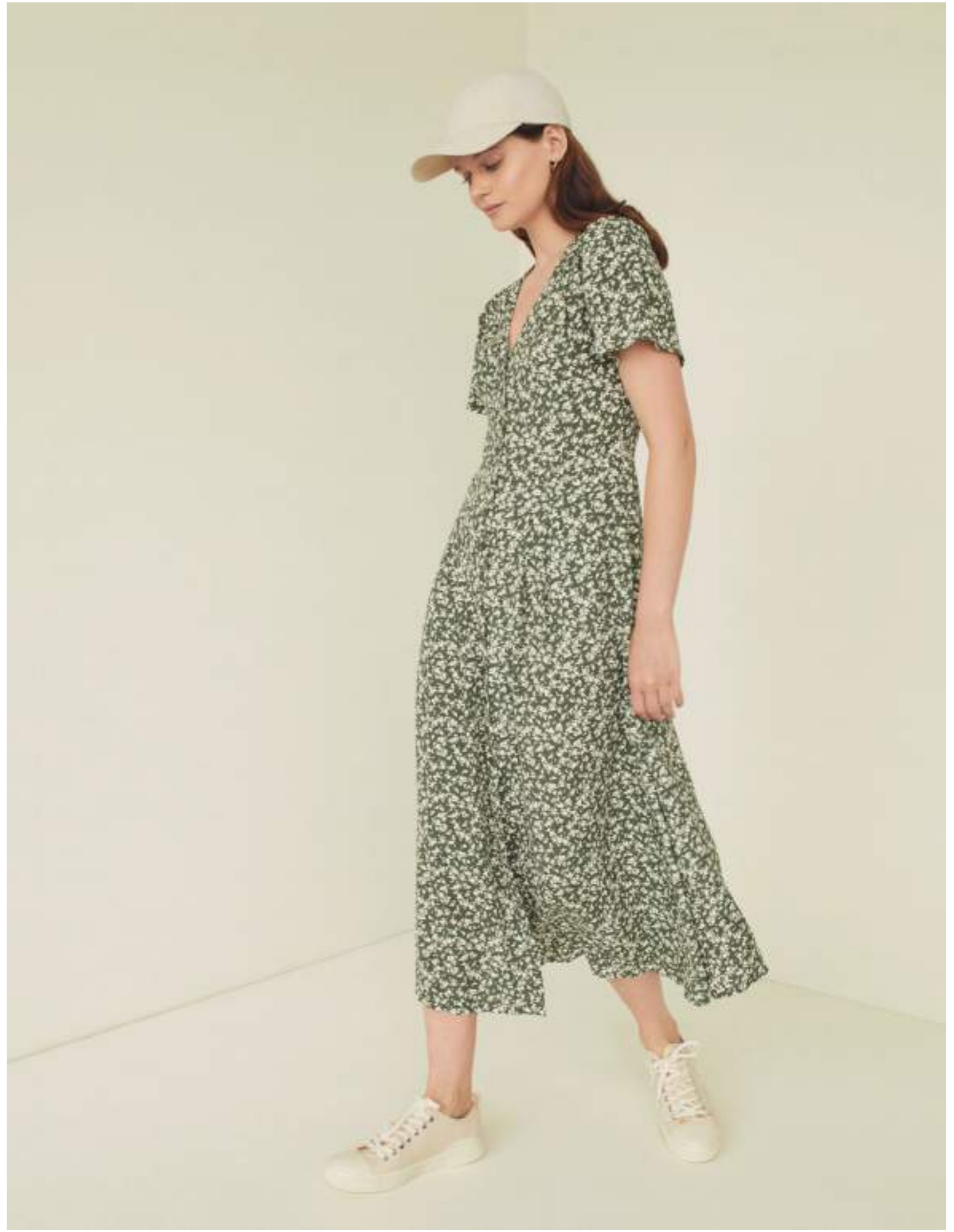
Dress 38878 | Cap 38925