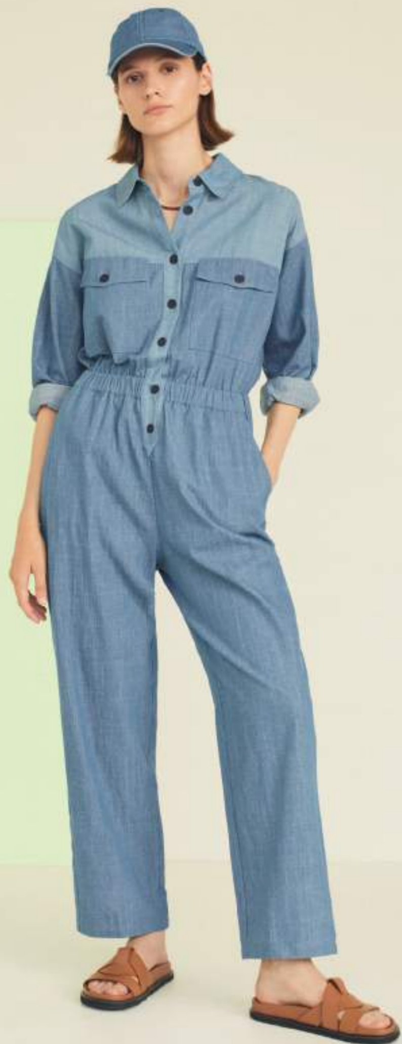
Jumpsuit 38828 Cap 38925