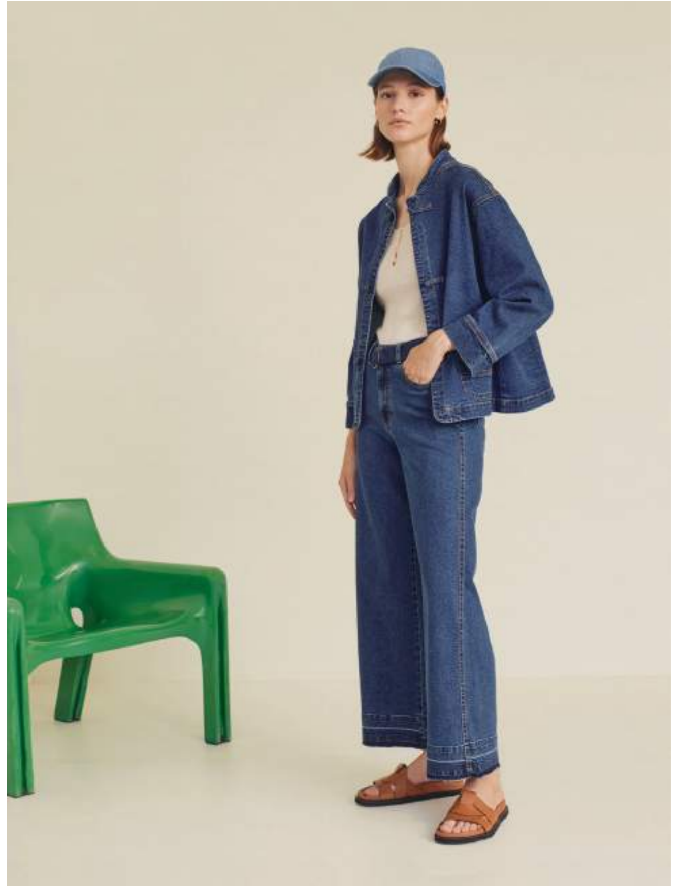
Jacket 38814 Top 38513 Pants 38812 Cap 38925