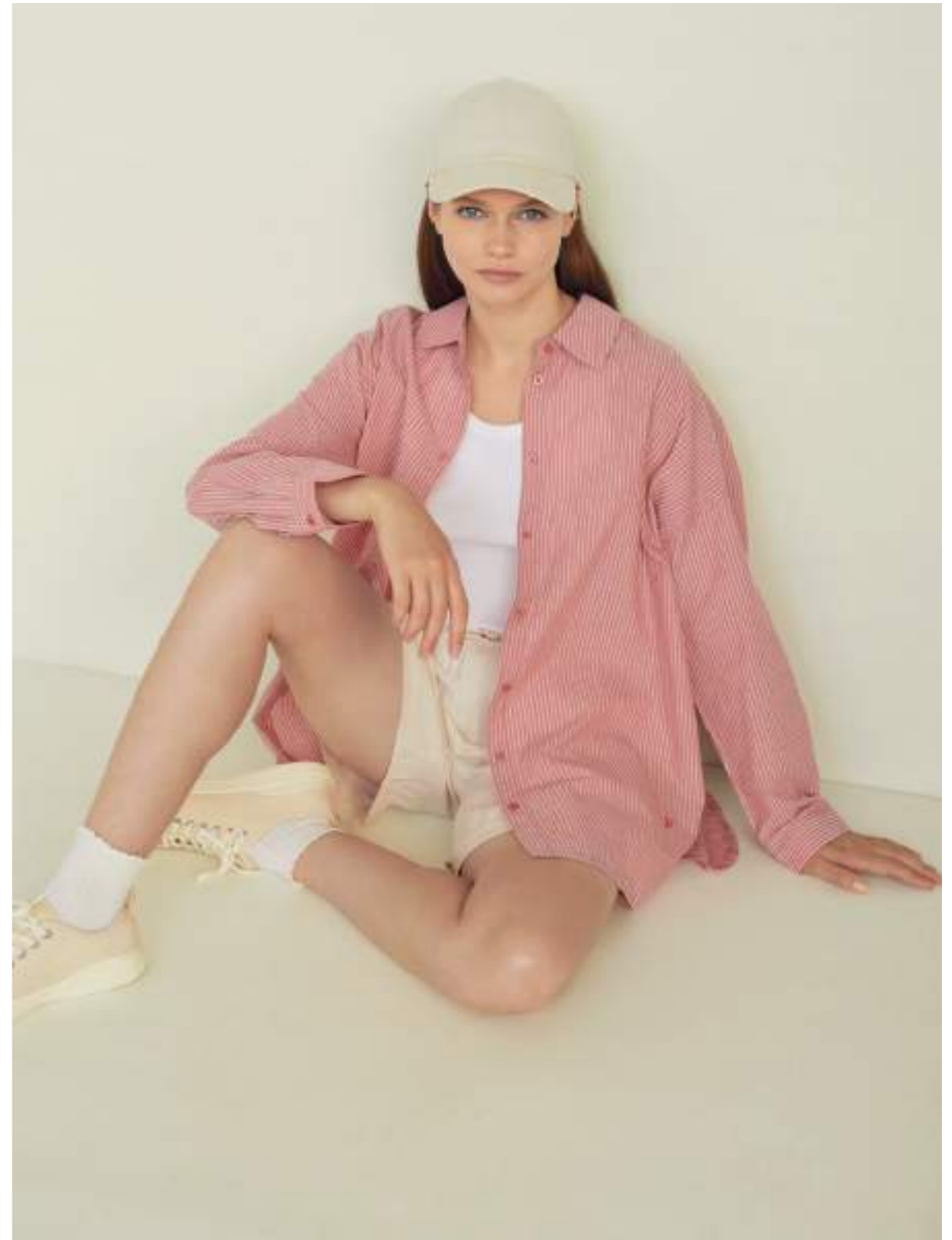
Cap 38925 Shirt 38837 Shorts 38892 T-shirt 38430