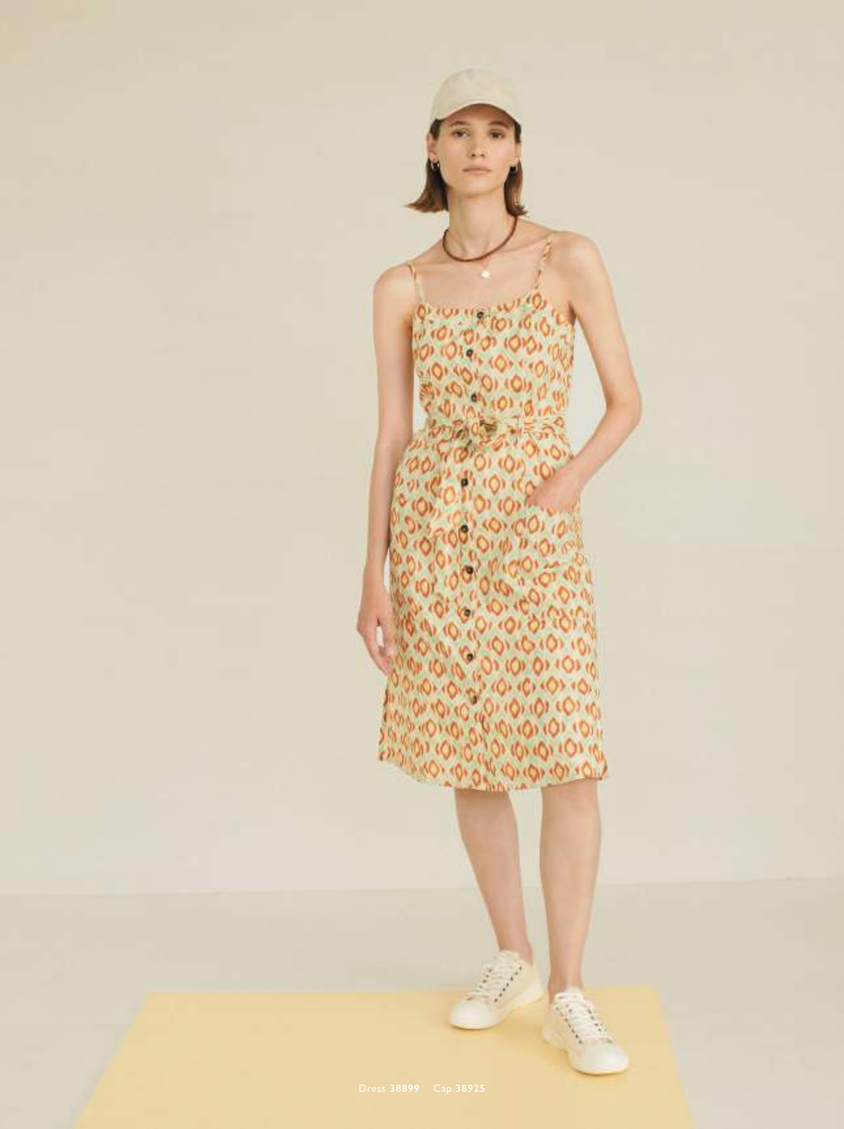
Dress 38899 Cap 38925